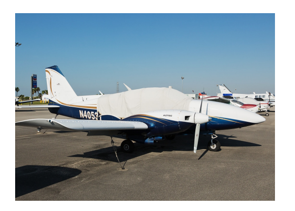
Piper Aztec Canopy Cover