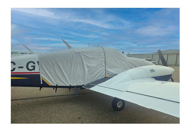
PA-23 Aztec Extended Canopy/Nose Cover, E & F Models