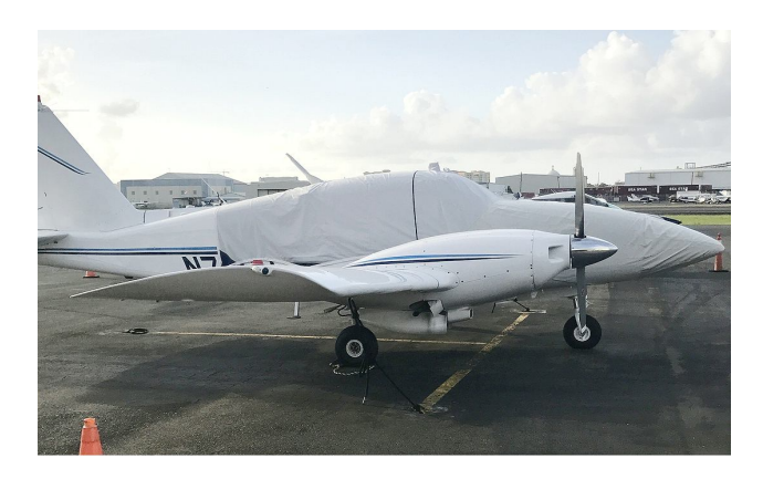
Piper Aztec Canopy/Nose Cover

Travel Covers are made with Silver Solution-Dyed Polyester fabric and only lined over the windshield to save weight. The material is lightweight and more compact for easy stowage in the aircraft. The polyester material is water resistant, but only intended for occasional use outside. We also have an ultra lightweight material available for fitted hangar dust covers. For daily outdoor use, the non-travel Sunbrella Cover is the best choice.