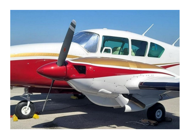
Piper Aztec Windshield HeatShield