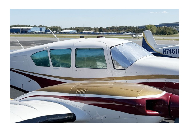
Piper Aztec HeatShields

Windshield Heatshields are interior sunshades for an aircraft's front windshield. The product is a unique composite of closed-cell foam with a silver mylar finish. The semi-rigid design is stiff enough to stand along the inside of the windshield using sun visors or window framing. It folds up flat and easily stores in the included storage sleeve. Some designs may require velcro and suction cups or split right and left sides. A Heatshield is an excellent short-term remedy for cockpit overheating. An external fabric cover is far more effective and practical for long-term protection.