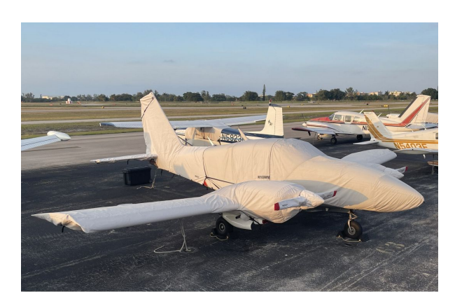
Piper Aztec Complete Cover Set