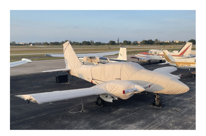
Piper Aztec Complete Cover Set