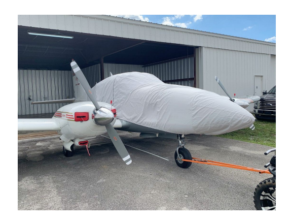
Piper Aztec Extended Canopy/Nose Cover, Engine Plugs