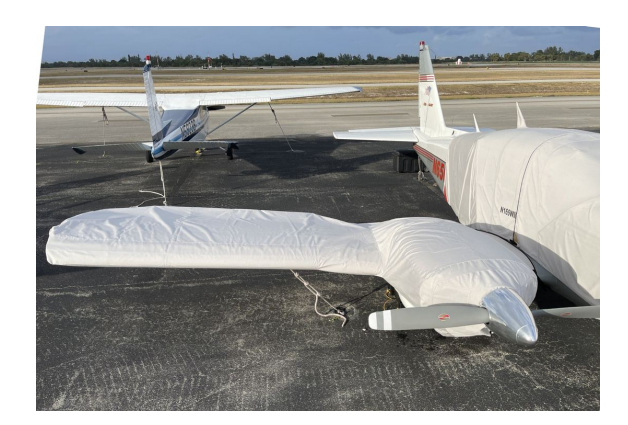
Piper Aztec Extended Canopy/Nose & Wing/Engine Covers

WINTER USE MATERIAL - Made with Solution-Dyed Polyester fabric, this option is intended for seasonal use to aid in deicing, rain mitigation, or for occasional travel. The material is lighter and more compact, but more susceptible to UV damage and may have a shorter useful life if used continuously outside than the all-year use material.