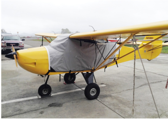
Avid Flyer Extended Canopy Cover