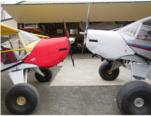
Avid Insulated Engine Covers