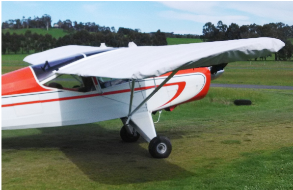
Auster J5 Autocar Wing Covers