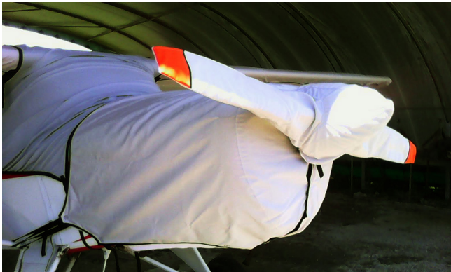
Auster J5 Canopy, Engine, and Propellor Covers