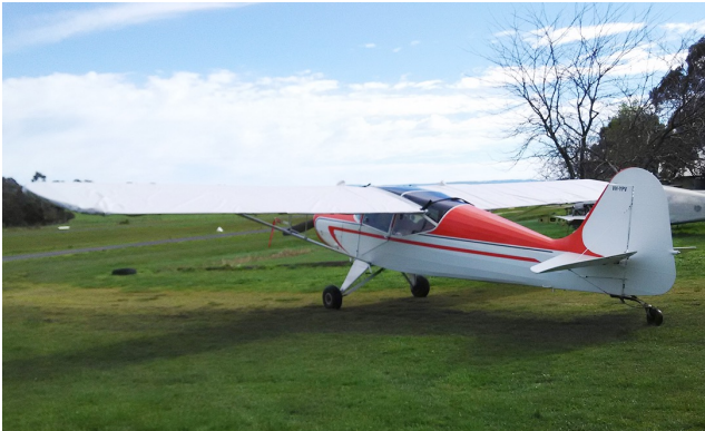
Auster J5 Autocar Wing Covers

WINTER USE MATERIAL - Made with Solution-Dyed Polyester fabric, this option is intended for seasonal use to aid in deicing, rain mitigation, or for occasional travel. The material is lighter and more compact, but more susceptible to UV damage and may have a shorter useful life if used continuously outside than the all-year use material.