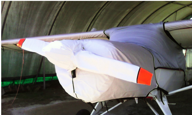
Auster J5 Canopy, Engine, and Propellor Covers