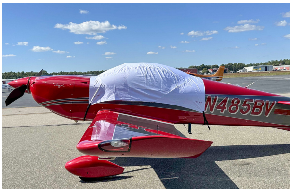
Aura Aero Integral R Canopy Cover, test fit cover

Travel Covers are made with Silver Solution-Dyed Polyester fabric and only lined over the windshield to save weight. The material is lightweight and more compact for easy stowage in the aircraft. The polyester material is water resistant, but only intended for occasional use outside. We also have an ultra lightweight material available for fitted hangar dust covers. For daily outdoor use, the non-travel Sunbrella Cover is the best choice.