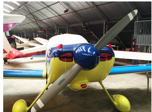
Van's RV-6 Engine Inlet Plugs