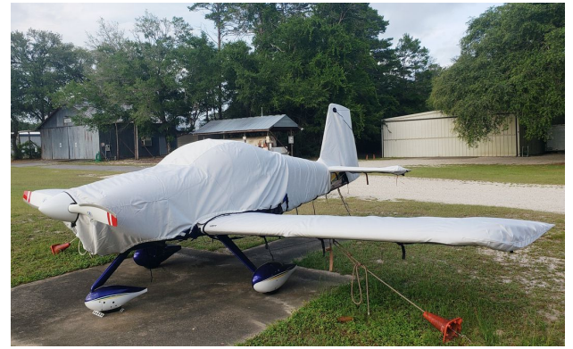
Van's RV-7A Cover Set