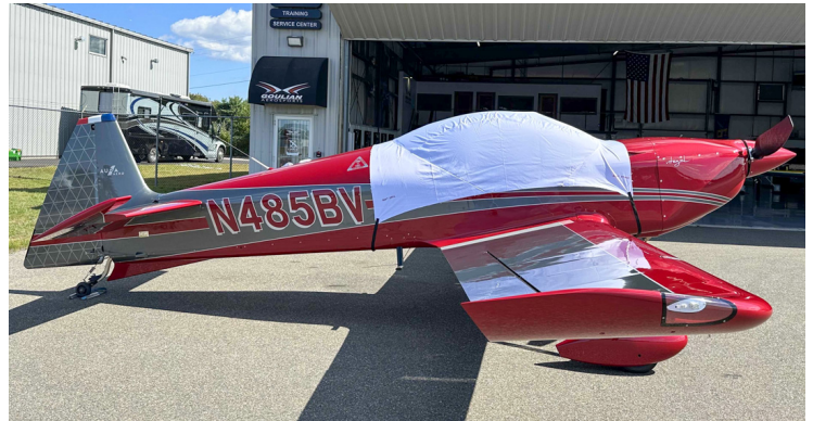
Aura Aero Integral R Canopy Cover, test fit cover