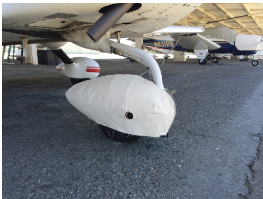
Grumman AA5 Nose Wheelpant Cover, test fit

ALL-YEAR USE MATERIAL - Made with Silver Acrylic Sunbrella canvas, the all-year use material is the best option for sun protection and cover longevity. This heavier more durable material is intended for all weather conditions, such as rain and snow or lots of sun.