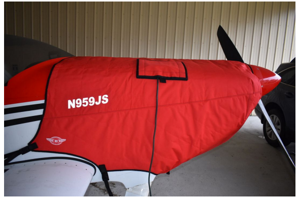
Van's RV-6 Insulated Engine Cover