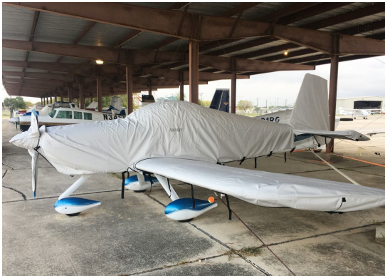
Van's RV-7A Complete Cover Set