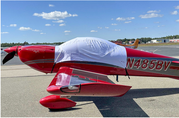
Aura Aero Integral R Canopy Cover, test fit cover

Travel Covers are made with Silver Solution-Dyed Polyester fabric and only lined over the windshield to save weight. The material is lightweight and more compact for easy stowage in the aircraft. The polyester material is water resistant, but only intended for occasional use outside. We also have an ultra lightweight material available for fitted hangar dust covers. For daily outdoor use, the non-travel Sunbrella Cover is the best choice.