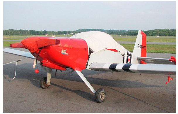
Van's RV-6 2-Blade Prop Cover