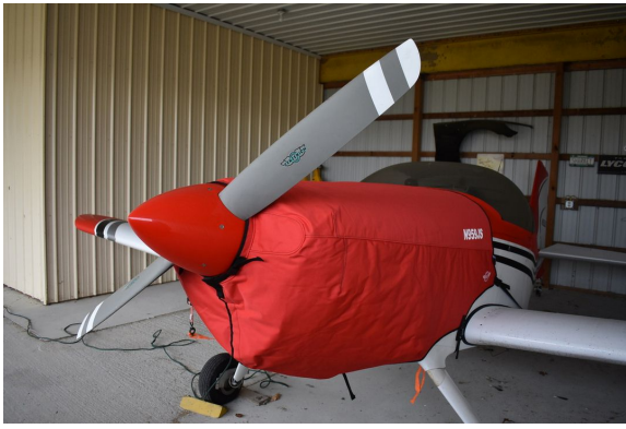
Van's RV-6 Insulated Engine Cover