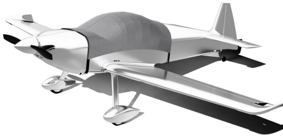
Aura Integral R Canopy Cover, 3D model

Travel Covers are made with Silver Solution-Dyed Polyester fabric and only lined over the windshield to save weight. The material is lightweight and more compact for easy stowage in the aircraft. The polyester material is water resistant, but only intended for occasional use outside. We also have an ultra lightweight material available for fitted hangar dust covers. For daily outdoor use, the non-travel Sunbrella Cover is the best choice.