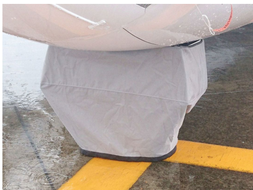
ATR-42/72 Nose Gear Landing Gear/Tire Covers