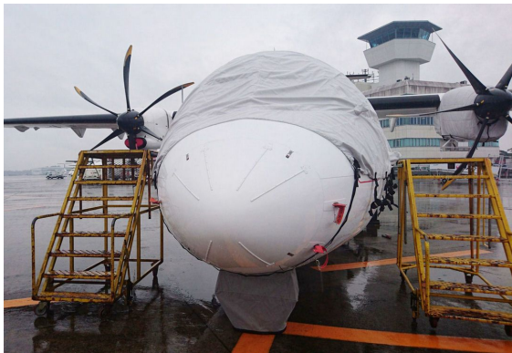
ATR-42/72 Cockpit Cover

This cover type is made from Silver Acrylic Sunbrella canvas and is 100% lined with a soft and smooth microfiber. Bruce's Custom Covers developed this material combination especially for aircraft protection. The outer material is medium weight and treated for water resistance, UV resistance and anti-static buildup. The inner lining is a very soft and smooth microfiber to prevent scratching. The material is very reflective, and tests show that the cabin interior temperature can be reduced to near-ambient temperature on the hottest of days. It is water, ice and snow repellent, yet breathable to allow moisture to escape from between the cover and the aircraft surface.