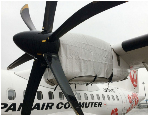
ATR-42/72 Engine Cover