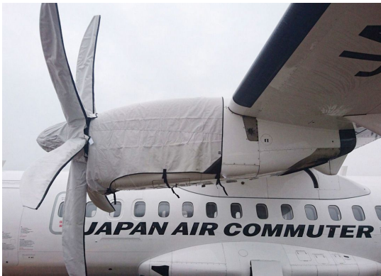
ATR-42/72 Engine Cover, 6-Blade Prop/Spinner Cover

water resistance, UV resistance and anti-static buildup. The inner lining is a very soft and smooth microfiber to prevent scratching. The material is very reflective, and tests show that the cabin interior temperature can be reduced to near-ambient temperature on the hottest of days. It is water, ice and snow repellent, yet breathable to allow moisture to escape from between the cover and the aircraft surface.