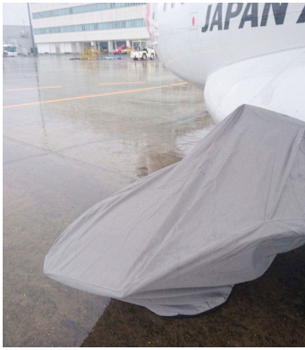
ATR-42/72 Main Gear Landing Gear/Tire Covers