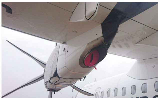
ATR-42/72 Exhaust Plugs