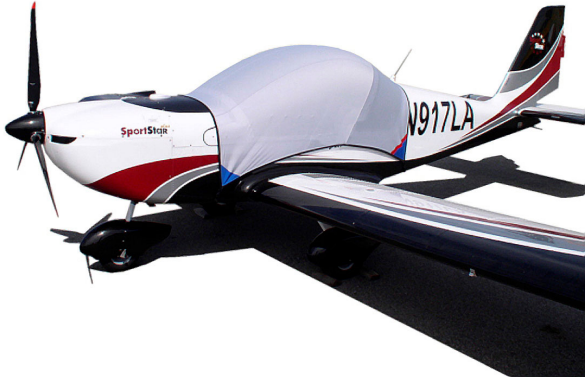
Evektor Sportstar Light Weight Travel-Cover