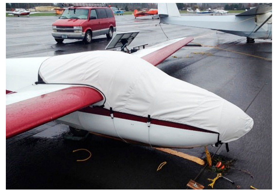
SGS 1-26B Canopy/Nose Cover