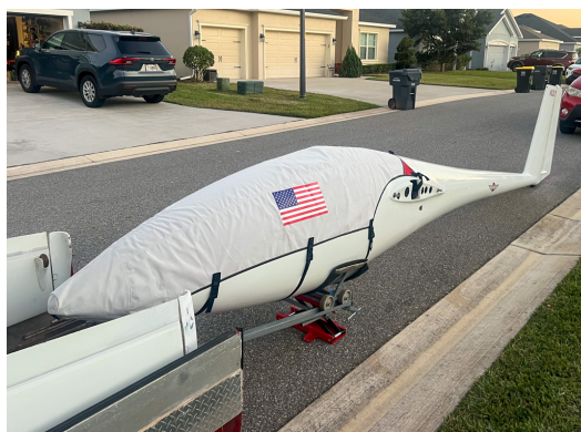
Schleicher ASW-20 Canopy/Nose Cover, ASW-20/20C