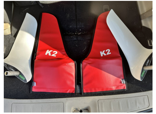
Discus CS Wingtip Pads (Set of 2)