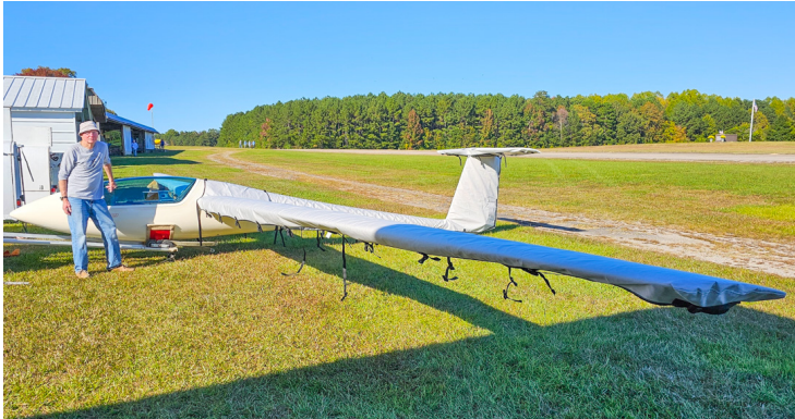
Schleicher ASW-19 Wing Covers, 15 Meter Wingspan, All Year Use