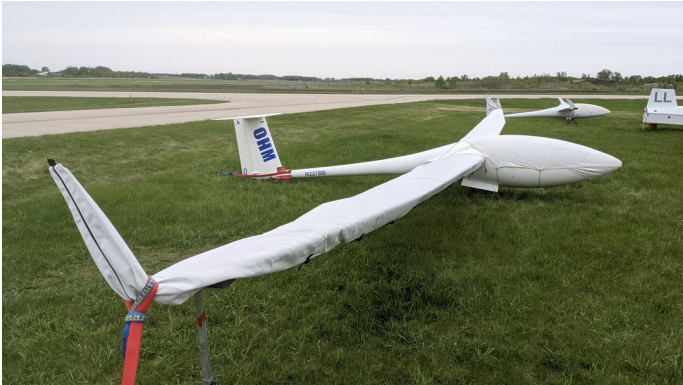
Schleicher ASW-27 Wing Covers

WINTER USE MATERIAL - Made with Solution-Dyed Polyester fabric, this option is intended for seasonal use to aid in deicing, rain mitigation, or for occasional travel. The material is lighter and more compact, but more susceptible to UV damage and may have a shorter useful life if used continuously outside than the all-year use material.