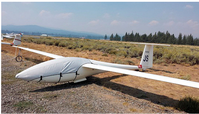
ASW-20C Canopy/Nose Cover