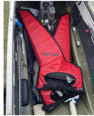
Sailplane Full Cover Set Graphic Indicators (Discus 2B, 3D model)