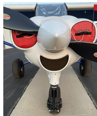
CubCrafters CC-18, 19, 20, Top Cub, CCK-1865, CC-19 X-Cub, CCX-2000, EX-3, FX-3 Engine Inlet Plugs