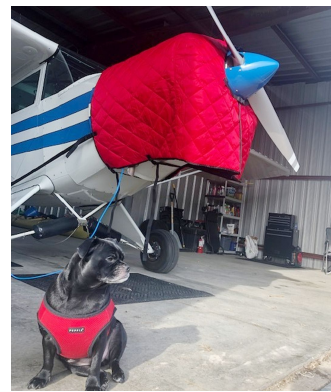
Piper PA-12 Insulated Hangar Blanket