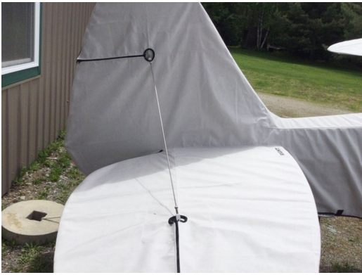
Piper PA-18-150 Super Cub Complete Cover Set