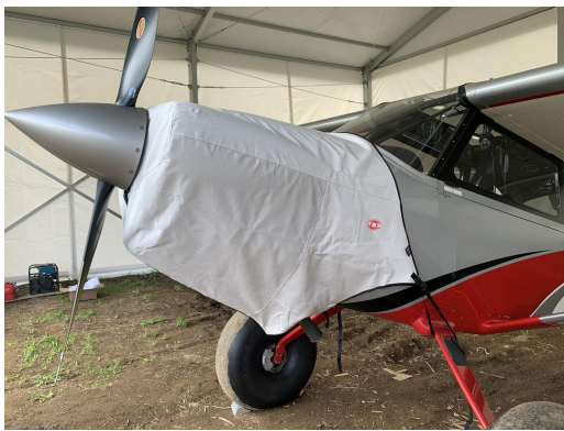
Cub Crafters CC-19 Engine Cover