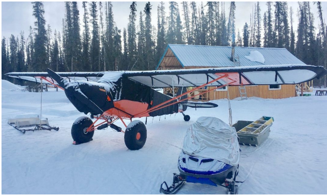
Piper PA-18 Super Cub Canopy Cover (Over-The-Top Style)