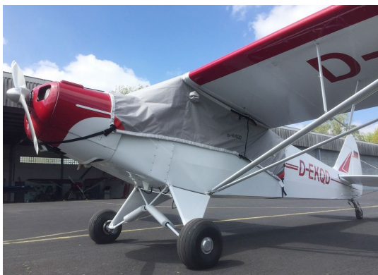
Piper Super Cub Travel Weight Canopy Cover

Travel Covers are made with Silver Solution-Dyed Polyester fabric and only lined over the windshield to save weight. The material is lightweight and more compact for easy stowage in the aircraft. The polyester material is water resistant, but only intended for occasional use outside. We also have an ultra lightweight material available for fitted hangar dust covers. For daily outdoor use, the non-travel Sunbrella Cover is the best choice.