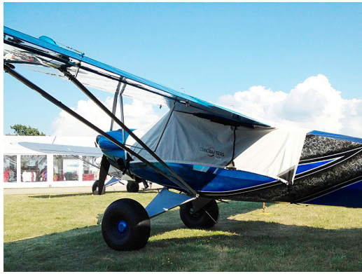
Cub Crafters Carbon Cub Canopy Cover