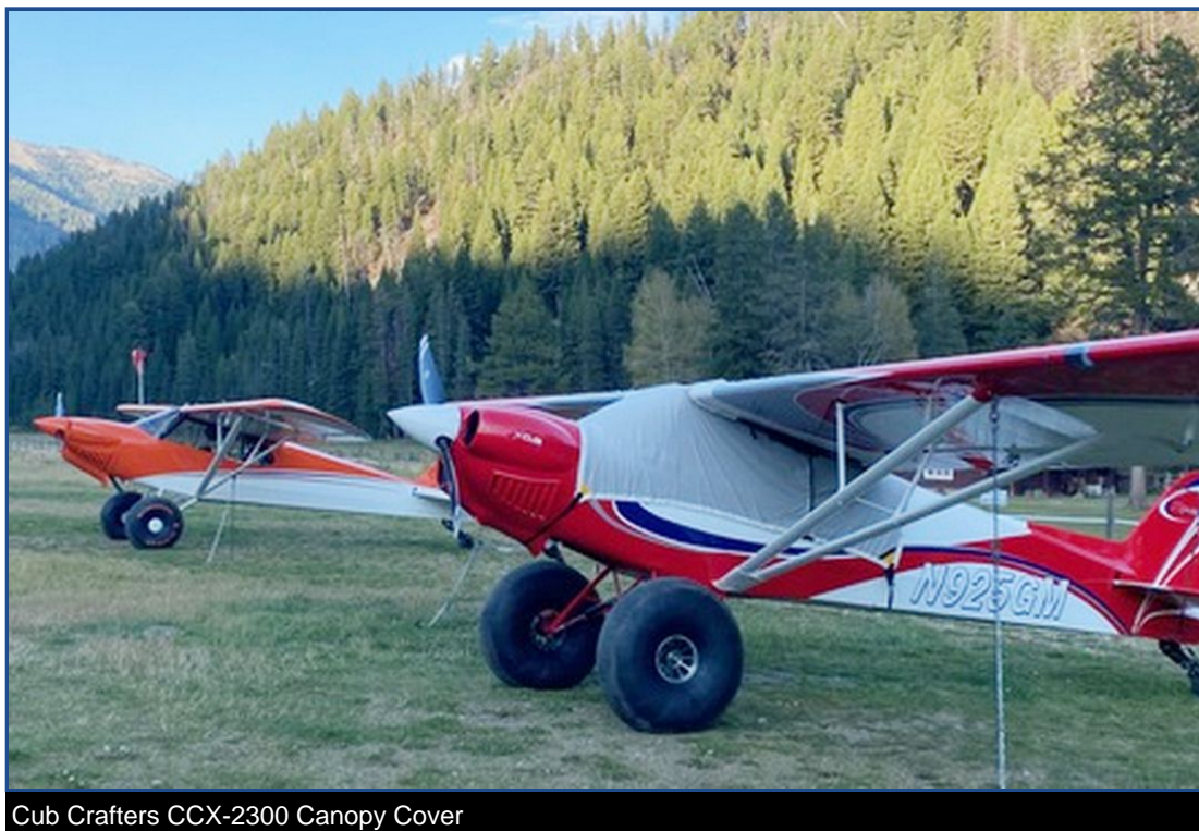
Cub Crafters CCX-2300 Canopy Cover