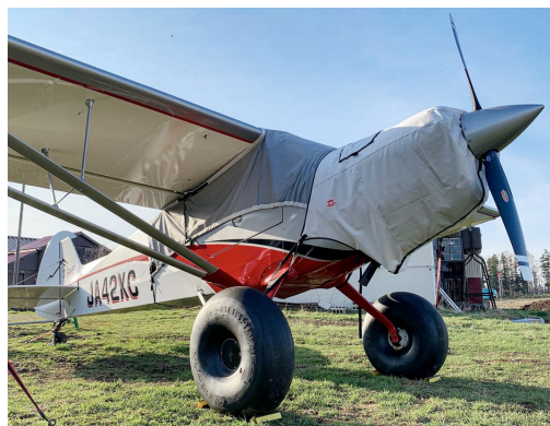
Cub Crafters CC19 X-Cub Engine Cover, Travel Weight Canopy Cover