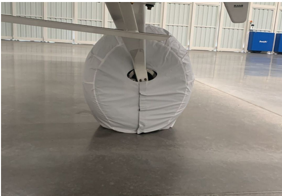
Cub Crafters Tire Covers, tricycle gear, test fit covers

ALL-YEAR USE MATERIAL - Made with Silver Acrylic Sunbrella canvas, the all-year use material is the best option for sun protection and cover longevity. This heavier more durable material is intended for all weather conditions, such as rain and snow or lots of sun.