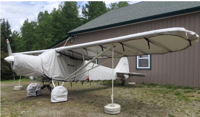
Piper PA-18-150 Super Cub Complete Cover Set