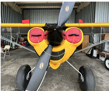
Cub Crafters CC-19 X-Cub Engine Plugs

Engine Inlet Plugs are custom fit for your Lewaero Ascender intakes, made with heavy-duty vinyl material, and stuffed with a single block of sculpted urethane foam. Each plug has a zipper that allows the foam to be removed and dried if necessary. Engine plugs have warning flags that are visible from the cockpit or 'remove before flight' streamers sewn onto the face of the plugs. Most plugs are imprinted with the aircraft registration number in black for an extra charge. Storage bag NOT included. Engine plugs may be inserted after flight when the engine is still warm. Engine Inlet Plugs are commonly referred to as Cowl Plugs, Intake Plugs, Cowl Blocks, Engine Blocks, and Engine Bungs.