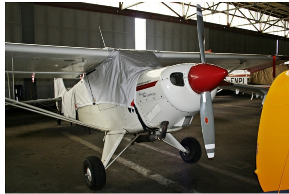
Aviat Husky Canopy Cover, Empennage Cover