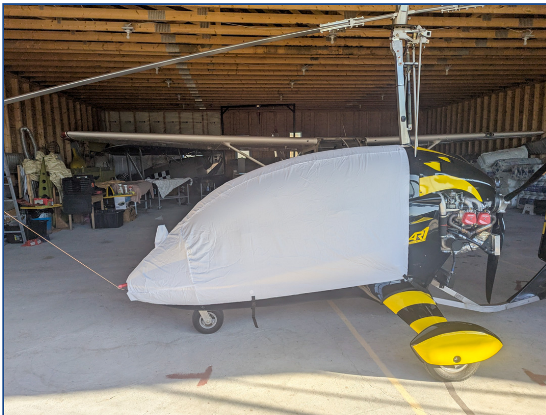
American Ranger AR-1 Gyrocopter Canopy/Nose Cover, enclosed cockpit