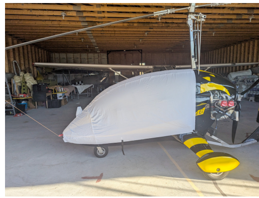
American Ranger AR-1 Gyrocopter Canopy/Nose Cover American Ranger AR-1 Gyrocopter Canopy/Nose Cover, enclosed cockpit