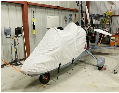
Magni Auto Gyro M16 Cockpit/Nose Cover