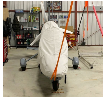
Magni Auto Gyro M16 Cockpit/Nose Cover