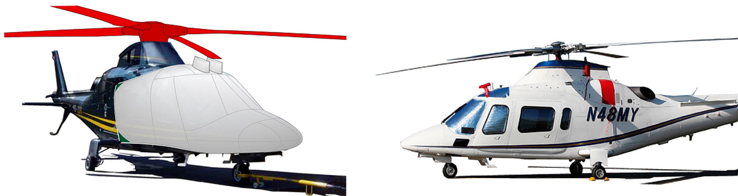
Agusta 109 Bubble, Rotor Hub & Blade Covers (illustration) Agusta Power Pitot Covers, Intake Covers, and Cockpit Heatshield set

WINTER USE MATERIAL - Made with Solution-Dyed Polyester fabric, this option is intended for seasonal use to aid in deicing, rain mitigation, or for occasional travel. The material is lighter and more compact, but more susceptible to UV damage and may have a shorter useful life if used continuously outside than the all-year use material.