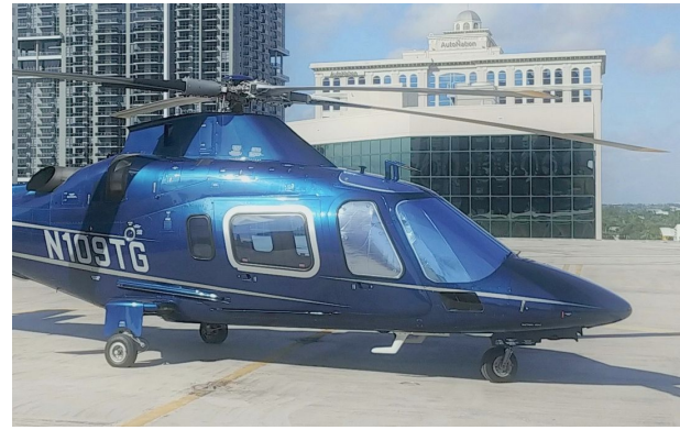
Agusta AW109 Power, A109E Heatshield Set