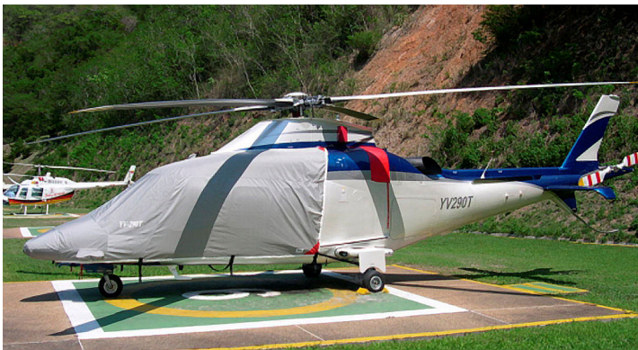
Agusta Grand Bubble Cover

Travel Covers are made with Silver Solution-Dyed Polyester fabric and fully lined over the entire cover. The material is lightweight and more compact for easy stowage in the aircraft. The polyester material is water resistant, but only intended for occasional use outside. We also have an ultra lightweight material available for fitted hangar dust covers. For daily outdoor use, the non-travel Sunbrella Cover is the best choice.