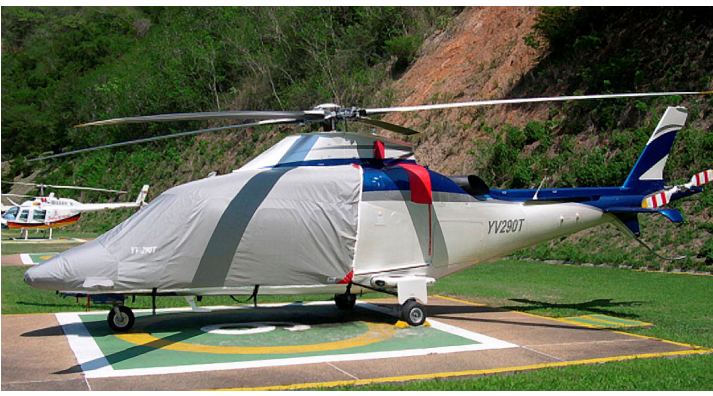
Agusta Grand Bubble Cover