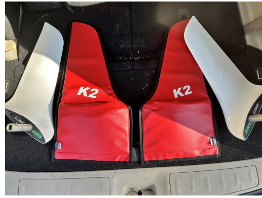
Discus CS Wingtip Pads (Set of 2)