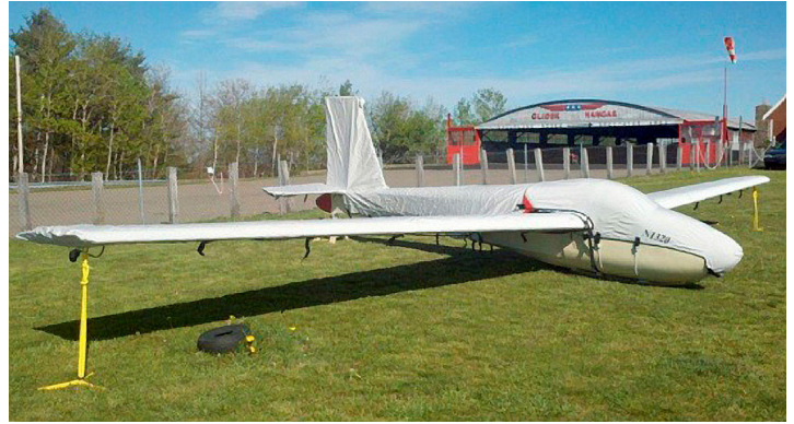
Schweizer 1-26B Canopy/Nose, Empennage & Wing Covers