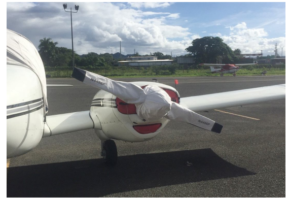
Piper Apache Engine Plugs, Prop Covers