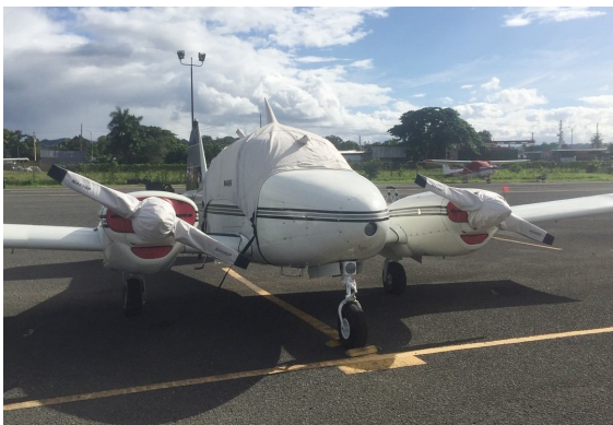
Piper Apache Engine Plugs, Prop Covers

This cover type is made from Silver Acrylic Sunbrella canvas and is 100% lined with a soft and smooth microfiber. Bruce's Custom Covers developed this material combination especially for aircraft protection. The outer material is medium weight and treated for water resistance, UV resistance and anti-static buildup. The inner lining is a very soft and smooth microfiber to prevent scratching. The material is very reflective, and tests show that the cabin interior temperature can be reduced to near-ambient temperature on the hottest of days. It is water, ice and snow repellent, yet breathable to allow moisture to escape from between the cover and the aircraft surface.