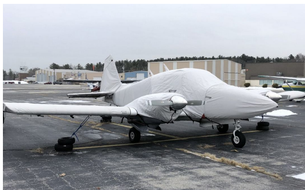
Piper PA-23 Apache Geronimo Extended Canopy Cover