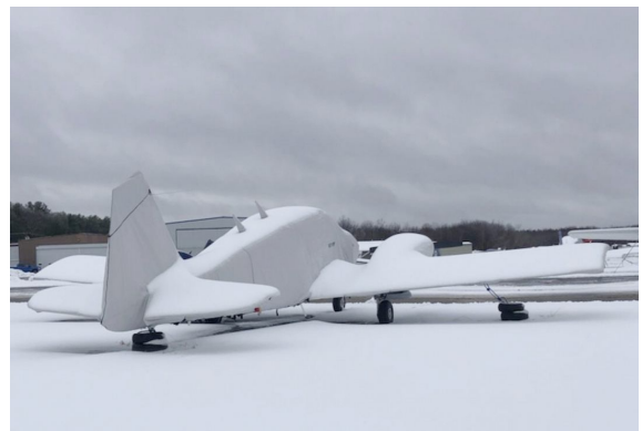
Piper Apache (Geronimo) Full Cover Set