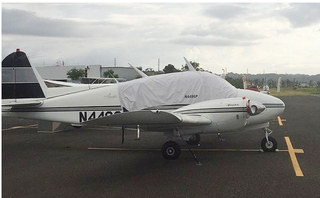
Piper PA-23-160 Apache Belly Strap Type Canopy Cover

This cover type is made from Silver Acrylic Sunbrella canvas and is 100% lined with a soft and smooth microfiber. Bruce's Custom Covers developed this material combination especially for aircraft protection. The outer material is medium weight and treated for water resistance, UV resistance and anti-static buildup. The inner lining is a very soft and smooth microfiber to prevent scratching. The material is very reflective, and tests show that the cabin interior temperature can be reduced to near-ambient temperature on the hottest of days. It is water, ice and snow repellent, yet breathable to allow moisture to escape from between the cover and the aircraft surface.