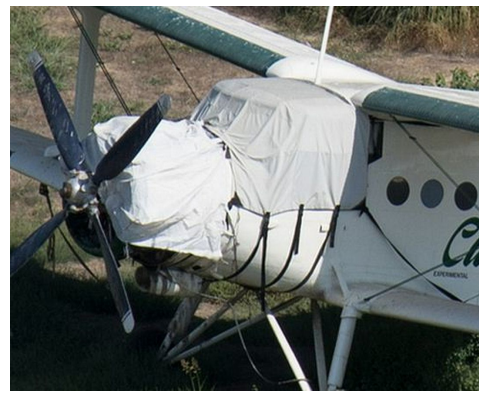
Antonov AN-2 Cockpit and Engine Covers