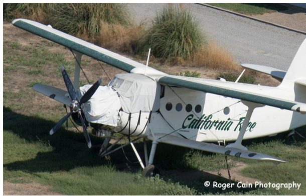
Antonov AN-2 Cockpit and Engine Covers