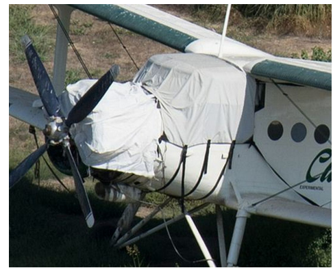
Antonov AN-2 Cockpit and Engine Covers