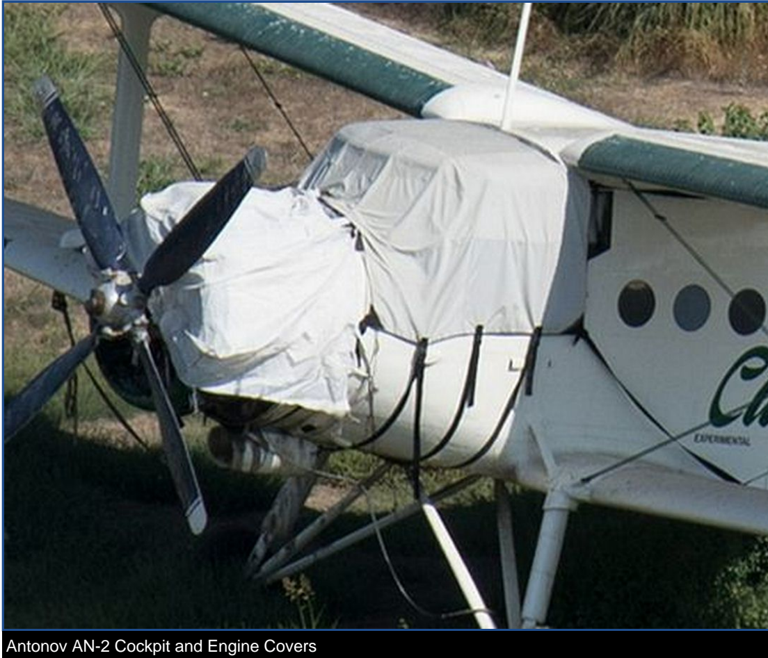
Antonov AN-2 Cockpit and Engine Covers