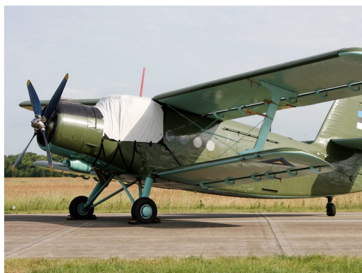
Antonov AN-2 Colt Canopy/Cockpit Cover