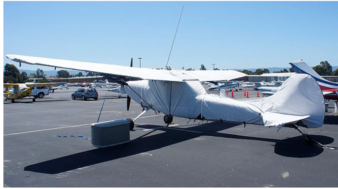
Cessna L-19 Extended Over-the-top Canopy, Engine, Empennage & Wing Covers