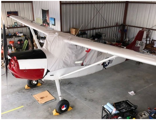
Cessna Bird Dog, L-19, O-1, 305 Canopy Cover, Over-Top Type