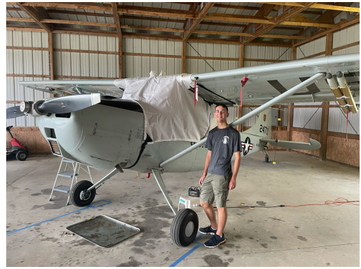
Cessna L-19E Bird Dog Over The Top Style Canopy Cover