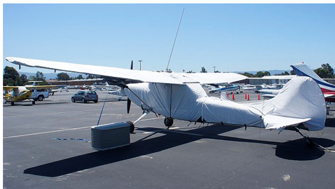
Cessna L-19 Extended Over-the-top Canopy, Engine, Empennage & Wing Covers