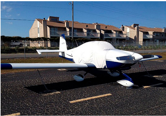
Van's RV-10 Extended Canopy Cover

This cover type is made from Silver Acrylic Sunbrella canvas and is 100% lined with a soft and smooth microfiber. Bruce's Custom Covers developed this material combination especially for aircraft protection. The outer material is medium weight and treated for water resistance, UV resistance and anti-static buildup. The inner lining is a very soft and smooth microfiber to prevent scratching. The material is very reflective, and tests show that the cabin interior temperature can be reduced to near-ambient temperature on the hottest of days. It is water, ice and snow repellent, yet breathable to allow moisture to escape from between the cover and the aircraft surface.