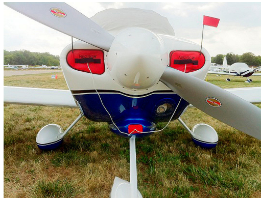
Van's RV-10 Canopy Cover & Engine Inlet Plugs

Engine Inlet Plugs are custom fit for your Direct Fly Alto intakes, made with heavy-duty vinyl material, and stuffed with a single block of sculpted urethane foam. Each plug has a zipper that allows the foam to be removed and dried if necessary. Engine plugs have warning flags that are visible from the cockpit or 'remove before flight' streamers sewn onto the face of the plugs. Most plugs are imprinted with the aircraft registration number in black for an extra charge. Storage bag NOT included. Engine plugs may be inserted after flight when the engine is still warm. Engine Inlet Plugs are commonly referred to as Cowl Plugs, Intake Plugs, Cowl Blocks, Engine Blocks, and Engine Bungs.