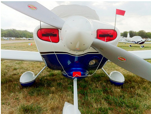
Van's RV-10 Canopy Cover & Engine Inlet Plugs

Engine Inlet Plugs are custom fit for your Direct Fly Alto intakes, made with heavy-duty vinyl material, and stuffed with a single block of sculpted urethane foam. Each plug has a zipper that allows the foam to be removed and dried if necessary. Engine plugs have warning flags that are visible from the cockpit or 'remove before flight' streamers sewn onto the face of the plugs. Most plugs are imprinted with the aircraft registration number in black for an extra charge. Storage bag NOT included. Engine plugs may be inserted after flight when the engine is still warm. Engine Inlet Plugs are commonly referred to as Cowl Plugs, Intake Plugs, Cowl Blocks, Engine Blocks, and Engine Bungs.