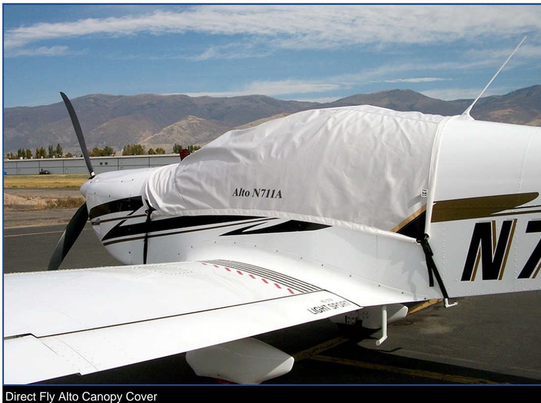
Direct Fly Alto Canopy Cover