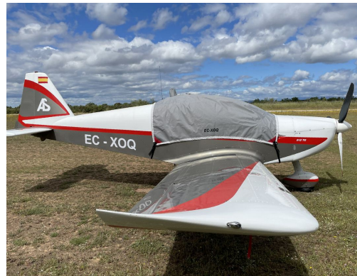
Direct Fly Alto Travel Cover, Light Weight Canopy Cover