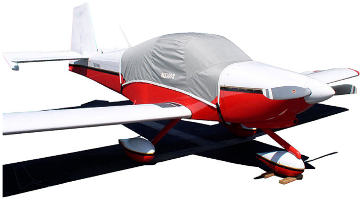
Van's RV-10 Canopy Cover