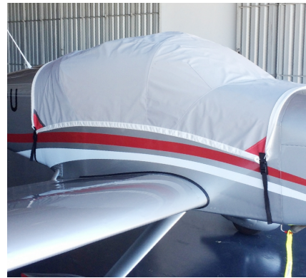
Vans's RV-9 Light Weight Travel Canopy Cover