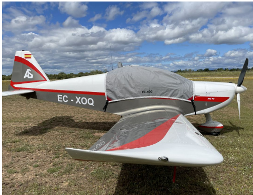
Direct Fly Alto Travel Cover, Light Weight Canopy Cover

Travel Covers are made with Silver Solution-Dyed Polyester fabric and only lined over the windshield to save weight. The material is lightweight and more compact for easy stowage in the aircraft. The polyester material is water resistant, but only intended for occasional use outside. We also have an ultra lightweight material available for fitted hangar dust covers. For daily outdoor use, the non-travel Sunbrella Cover is the best choice.