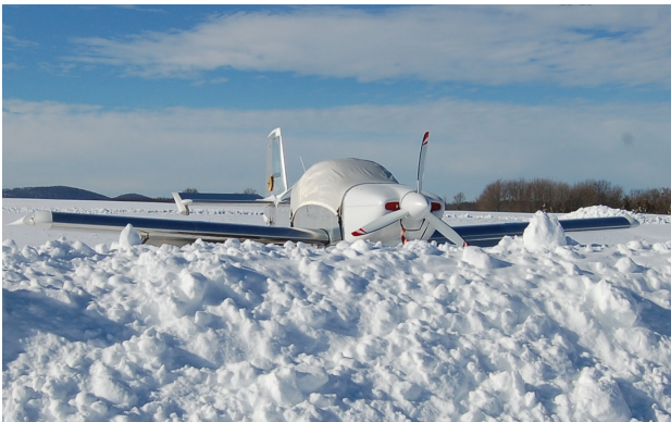
Van's RV-6 Canopy Cover