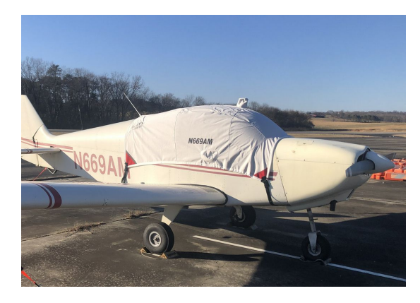
AMD Alarus CH2000 Std Canopy Cover & Engine Plugs (Illustration)