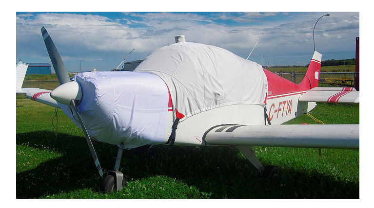
Alarus CH2000 Canopy Cover & Engine Cover (test fit)

This cover type is made from Silver Acrylic Sunbrella canvas and is 100% lined with a soft and smooth microfiber. Bruce's Custom Covers developed this material combination especially for aircraft protection. The outer material is medium weight and treated for water resistance, UV resistance and anti-static buildup. The inner lining is a very soft and smooth microfiber to prevent scratching. The material is very reflective, and tests show that the cabin interior temperature can be reduced to near-ambient temperature on the hottest of days. It is water, ice and snow repellent, yet breathable to allow moisture to escape from between the cover and the aircraft surface.