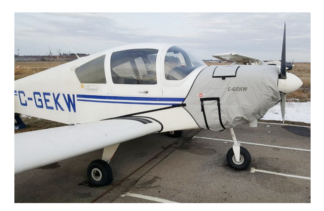
Alarus CH-2000 Insulated Engine Cover