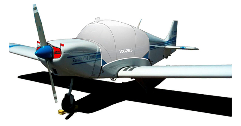
Alarus CH2000 Engine Plugs