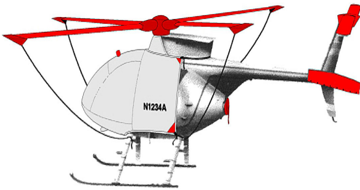
Full Cover Set