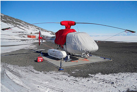
AS355 Bubble Cover w/ Cargo Mirror, Blade Tie-downs, Insulated Engine, Insulated Main Rotor Hub & Insulated Tail Rotor Covers