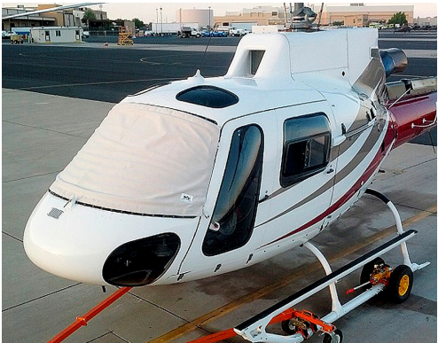
AS350 Windshield Cover, pinches in door jambs

Travel Covers are made with Silver Solution-Dyed Polyester fabric and fully lined over the entire cover. The material is lightweight and more compact for easy stowage in the aircraft. The polyester material is water resistant, but only intended for occasional use outside. We also have an ultra lightweight material available for fitted hangar dust covers. For daily outdoor use, the non-travel Sunbrella Cover is the best choice.