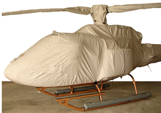
AS350 Main Body, Rotor Head, Blades and Tailboom Covers