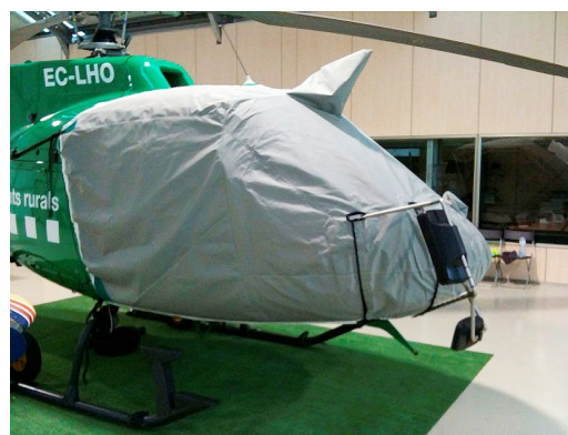
AS350 Bubble Cover with Wire Strike and Cargo Mirror