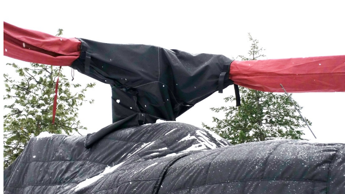
Main Rotor Hub Cover with swash plate extension.

WINTER USE MATERIAL - Made with Solution-Dyed Polyester fabric, this option is intended for seasonal use to aid in deicing, rain mitigation, or for occasional travel. The material is lighter and more compact, but more susceptible to UV damage and may have a shorter useful life if used continuously outside than the all-year use material.