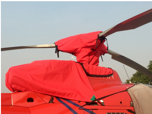
Airbus H-125 & Aerospatiale AS350 Intake/Exhaust Cover, Main Rotor Hub Cover with Weighted Skirt