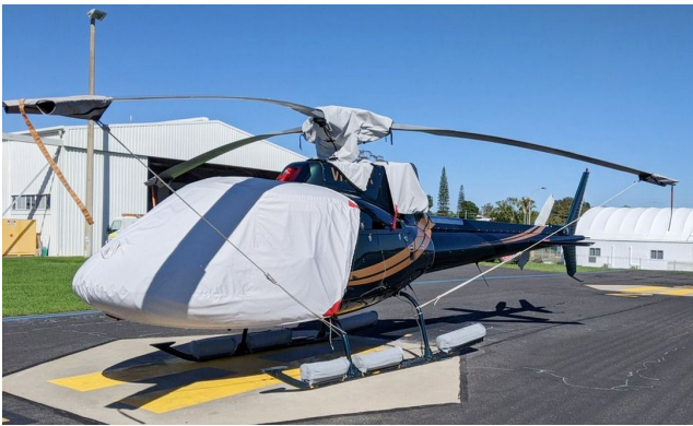
AS350 Bubble, Main Rotor, Intake & Tail Rotor Covers

WINTER USE MATERIAL - Made with Solution-Dyed Polyester fabric, this option is intended for seasonal use to aid in deicing, rain mitigation, or for occasional travel. The material is lighter and more compact, but more susceptible to UV damage and may have a shorter useful life if used continuously outside than the all-year use material.