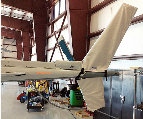
AS350 B3 Vertical Stabilizer Covers (set of 2)

The Tailboom Cover details vary by model, but generally the helicopter tail boom cover encloses the tail boom from the "bottleneck" to the aft end. They usually also cover the horizontal stabilizers, and are custom made to allow for antennae, lights, and other protrusions. They attach with straps underneath the tail boom. Covers for the vertical and horizontal stabilizers are also available separately. Specific information for each model is available on request.