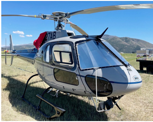
Eurocopter AS350-B3 Cabin HeatShields, Intake/Exhaust Cover