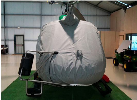
AS350 Bubble Cover with Wire Strike and Cargo Mirror

water resistance, UV resistance and anti-static buildup. The inner lining is a very soft and smooth microfiber to prevent scratching. The material is very reflective, and tests show that the cabin interior temperature can be reduced to near-ambient temperature on the hottest of days. It is water, ice and snow repellent, yet breathable to allow moisture to escape from between the cover and the aircraft surface.