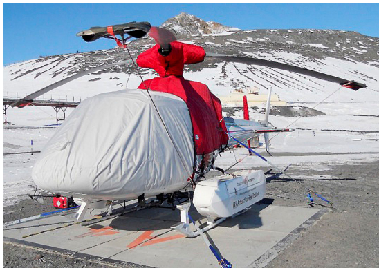
AS350 Bubble Cover w/ Cargo Mirror, Blade Tie-downs, Insulated Engine, Insulated Main Rotor Hub and Insulated Tail Rotor Covers

WINTER USE MATERIAL - Made with Solution-Dyed Polyester fabric, this option is intended for seasonal use to aid in deicing, rain mitigation, or for occasional travel. The material is lighter and more compact, but more susceptible to UV damage and may have a shorter useful life if used continuously outside than the all-year use material.