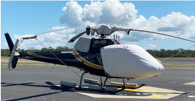
Airbus Helicopter H350 Bubble/Rotor Mast, & Intake Covers