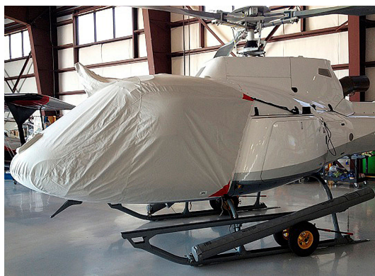
AS350 B3 Bubble Cover