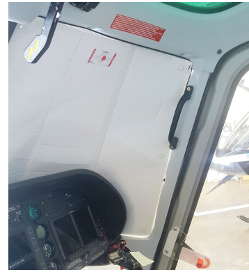
Aerospatiale AS350 Astar, Ecureuil, Esquilo, Fennec Windshield Heatshields