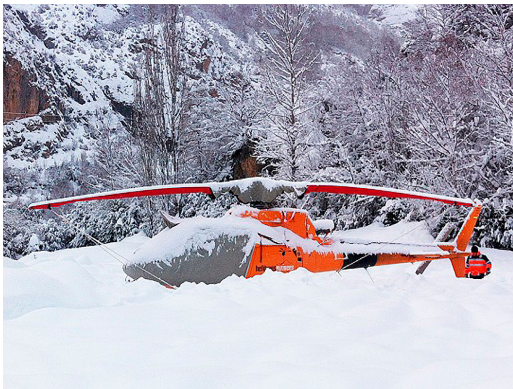
AS350 Bubble Cover, Insulated Main & Tail Rotor Covers, Blade Covers with tid-down detail