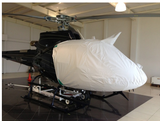
AS350 Bubble Cover