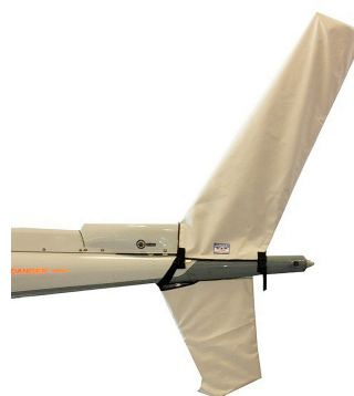
AS350B3 Vertical Stabilizers cover