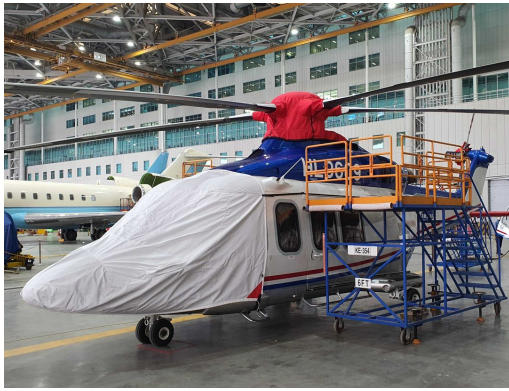
Agusta AW139 Cockpit/Nose, Rotor Mast Cover