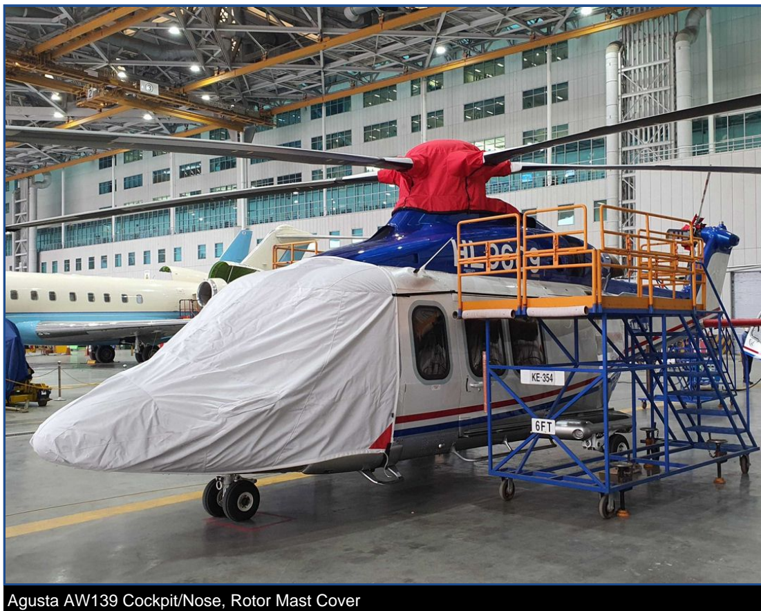
Agusta AW139 Cockpit/Nose, Rotor Mast Cover