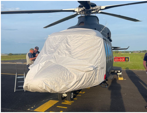
Agusta AW139 Cockpit/Nose Cover