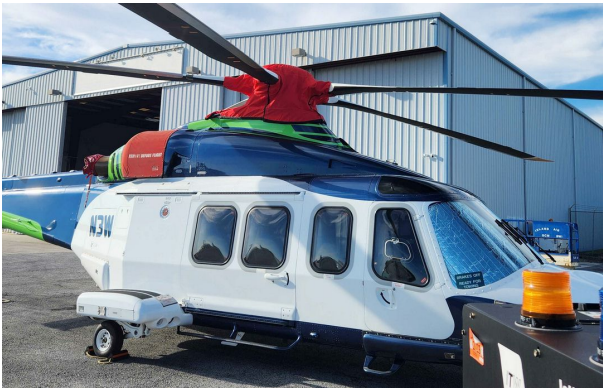
Agusta AW139 Cockpit/Nose, Rotor Mast Cover Agusta AW139 Rotor Mast Cover, covers upper deck & aft of rotor mast area