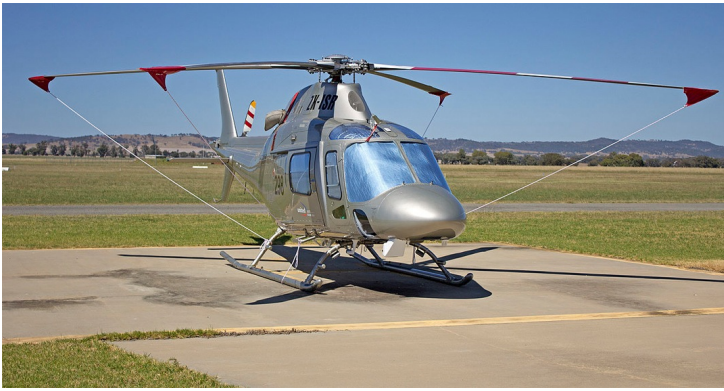
Agusta 119 Cockpit/Cabin HeatShields