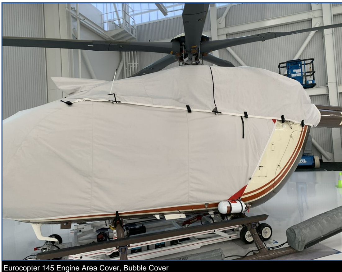
Eurocopter 145 Engine Area Cover, Bubble Cover