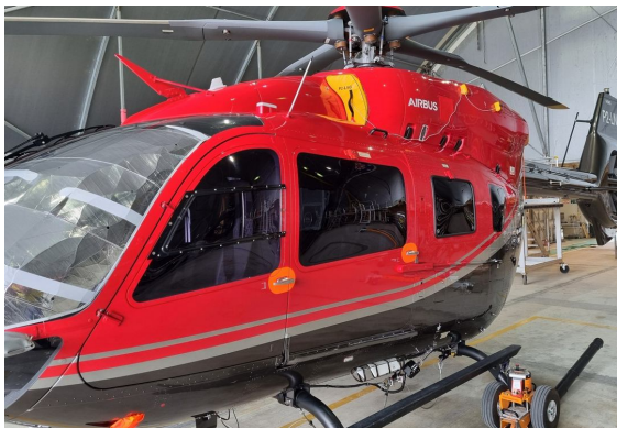
Airbus Helicopter H145D3 Intake Plugs

The Engine Inlet Plugs are custom fit for your Airbus Helicopter H145, UH-145, BK-117 D-2, D-3 intakes, made with heavy-duty vinyl material, and stuffed with a single block of sculpted urethane foam. Each plug has a zipper that allows the foam to be removed and dried if necessary. Engine plugs have 'Remove Before Flight' streamers sewn onto the face of the plugs. Most plugs are imprinted with the aircraft registration number in black for an extra charge. Storage bag NOT included. Engine plugs may be inserted after flight when the engine is still warm. Engine Inlet Plugs are commonly referred to as Cowl Plugs, Intake Plugs, Cowl Blocks, Engine Blocks, and Engine Bungs.