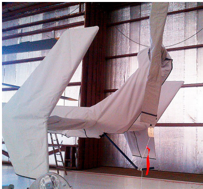
Tail Rotor Cover & Tailboom, Vertical Pylon & Stabilizers Cover

The Tailboom Cover details vary by model, but generally the helicopter tail boom cover encloses the tail boom from the "bottleneck" to the aft end. They usually also cover the horizontal stabilizers, and are custom made to allow for antennae, lights, and other protrusions. They attach with straps underneath the tail boom. Covers for the vertical and horizontal stabilizers are also available separately. Specific information for each model is available on request.