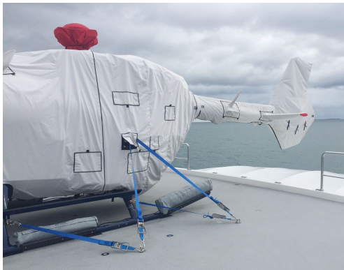
Eurocopter EC-145 D2 Main Body Cover, Tailboom/Fenestron Cover

The Tailboom Cover details vary by model, but generally the helicopter tail boom cover encloses the tail boom from the "bottleneck" to the aft end. They usually also cover the horizontal stabilizers, and are custom made to allow for antennae, lights, and other protrusions. They attach with straps underneath the tail boom. Covers for the vertical and horizontal stabilizers are also available separately. Specific information for each model is available on request.