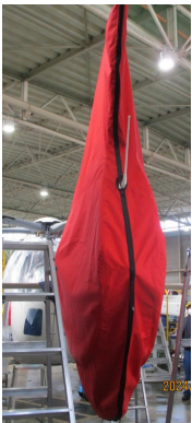
Airbus EC145 Tailfan Housing Fenestron Cover