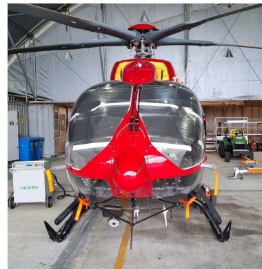
Airbus Helicopter H145D3 Windshield Heatshields, Engine Plugs