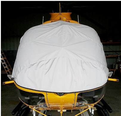
Bubble Cover w/ nose mounted radome & Upper Deck Plugs/Cover EC-135 Windshield/Skylights Cover, pinches in door jambs