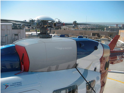
Upper Deck Plugs/Cover