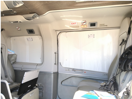
Eurocopter EC-145 Cabin Heatshields

Heatshields are interior sunshades for an aircraft's windows or canopy glass. The product is a unique composite of closed-cell foam with a silver mylar finish. The semi-rigid design is stiff enough to stand along the inside of the windshield using sun visors or window framing. It folds up flat and easily stores in the included storage sleeve. Some designs may require velcro and suction cups. A Heatshield is an excellent short-term remedy for cockpit overheating.