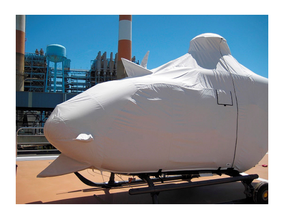
EC-135 Fuselage Cover