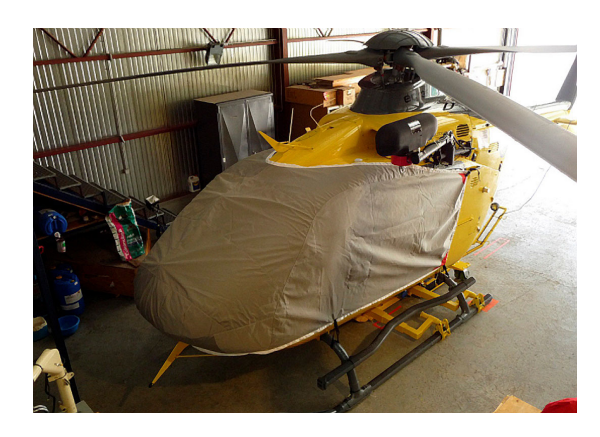
Eurocopter EC-135 Bubble Cover

This cover type is made from Silver Acrylic Sunbrella canvas and is 100% lined with a soft and smooth microfiber. Bruce's Custom Covers developed this material combination especially for aircraft protection. The outer material is medium weight and treated for water resistance, UV resistance and anti-static buildup. The inner lining is a very soft and smooth microfiber to prevent scratching. The material is very reflective, and tests show that the cabin interior temperature can be reduced to near-ambient temperature on the hottest of days. It is water, ice and snow repellent, yet breathable to allow moisture to escape from between the cover and the aircraft surface.