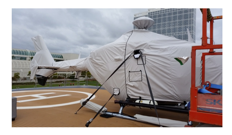
EC-135 Full Cover Set

The Tailboom Cover details vary by model, but generally the helicopter tail boom cover encloses the tail boom from the "bottleneck" to the aft end. They usually also cover the horizontal stabilizers, and are custom made to allow for antennae, lights, and other protrusions. They attach with straps underneath the tail boom. Covers for the vertical and horizontal stabilizers are also available separately. Specific information for each model is available on request.