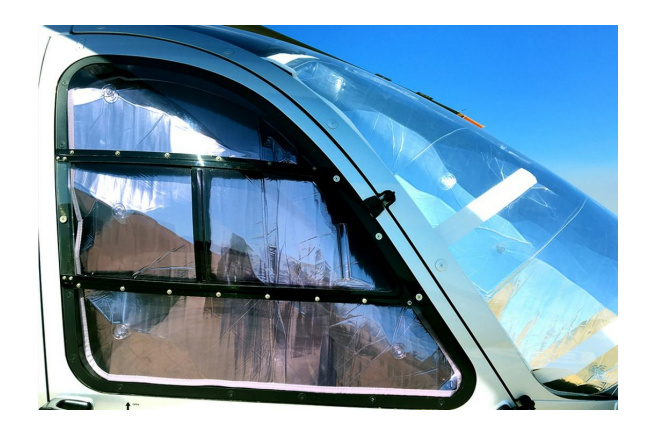
Airbus EC-135 Cockpit HeatShields

Heatshields are interior sunshades for an aircraft's windows or canopy glass. The product is a unique composite of closed-cell foam with a silver mylar finish. The semi-rigid design is stiff enough to stand along the inside of the windshield using sun visors or window framing. It folds up flat and easily stores in the included storage sleeve. Some designs may require velcro and suction cups. A Heatshield is an excellent short-term remedy for cockpit overheating.