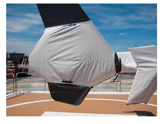
EC-135 Tailfan Cover and Tailboom Stabilizer Cover