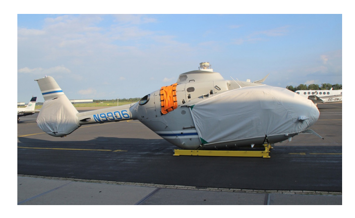
Eurocopter EC-135 Bubble & Tailfan Covers