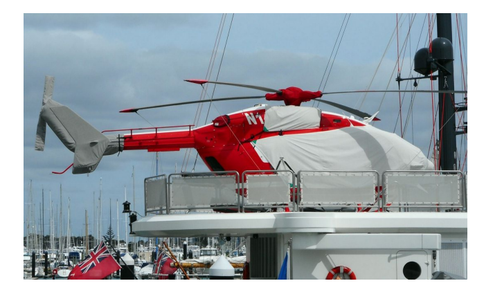
Eurocopter EC-135 Bubble, Engine, Rotor Hub, Tail Surfaces Covers