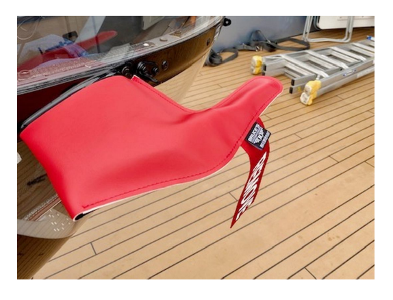
Airbus Helicopter H145 Pitot Tube Cover