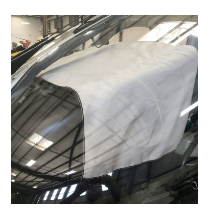
Eurocopter EC-135 Instrument Panel Heatshield Cover