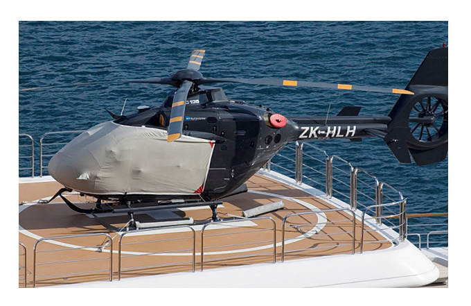
EC-135 Bubble Cover & Exhaust Plugs