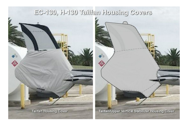
Airbus Helicopter H-130 Tailfan Housing Covers