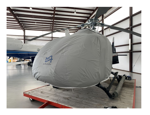
Airbus H-130 Bubble Cover, Travel Weight