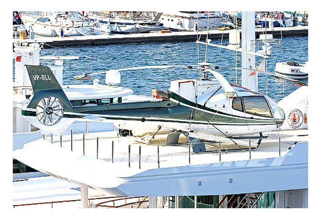
EC-130 Front, Side and Skylight Window HeatShields