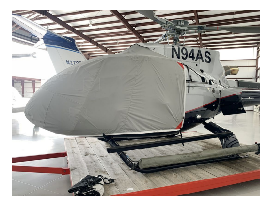
Airbus H-130 Bubble Cover, Travel Weight