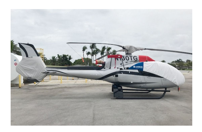
AIRBUS H130 T2, Intake, Exhaust & Tailfan Covers

The Tailboom Cover details vary by model, but generally the helicopter tail boom cover encloses the tail boom from the "bottleneck" to the aft end. They usually also cover the horizontal stabilizers, and are custom made to allow for antennae, lights, and other protrusions. They attach with straps underneath the tail boom. Covers for the vertical and horizontal stabilizers are also available separately. Specific information for each model is available on request.