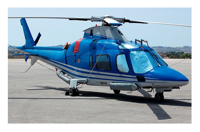
Agusta Power Cockpit HeatShields & Blade Tie-downs