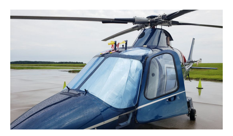
Agusta AW109S/SP Grand Heatshield Set

A Heatshield is an excellent short-term remedy for cockpit overheating.