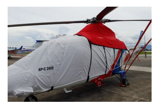
Agusta Grand AW109 SP Bubble & Engine Covers