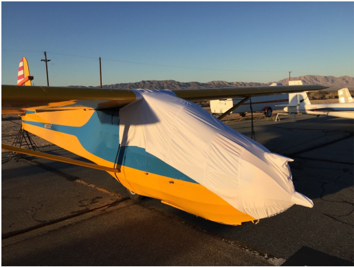
Schweizer SGU 2-22EK Canopy/Nose Cover, test fit cover