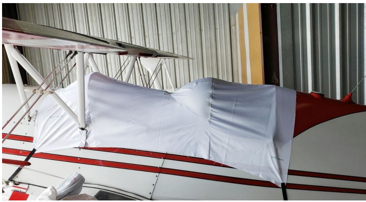
Acro Sport 2 Canopy Cover, test fit cover