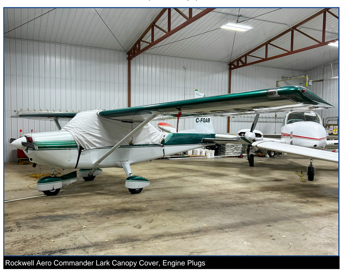
Section 1: Canopy/Cockpit/Fuselage Covers

Canopy Covers help reduce damage to your airplane's upholstery and avionics caused by excessive heat, and they can eliminate problems caused by leaking door and window seals. They keep the windshield and window surfaces clean and help prevent vandalism and theft.