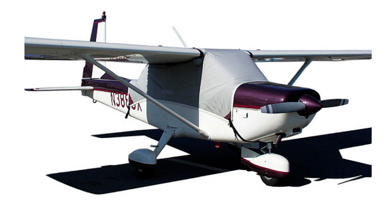
Rockwell Aero Commander Lark Canopy Cover, Engine Plugs