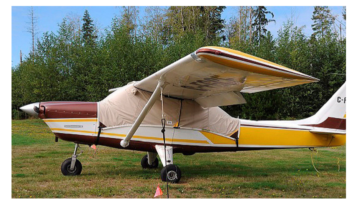
Lark Canopy Cover