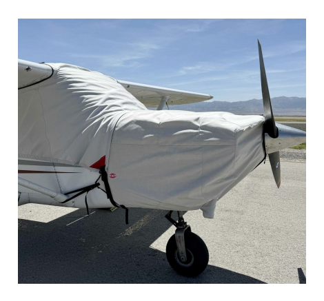
Aero Commander Lark Engine Cover

water resistance, UV resistance and anti-static buildup. The inner lining is a very soft and smooth microfiber to prevent scratching. The material is very reflective, and tests show that the cabin interior temperature can be reduced to near-ambient temperature on the hottest of days. It is water, ice and snow repellent, yet breathable to allow moisture to escape from between the cover and the aircraft surface.