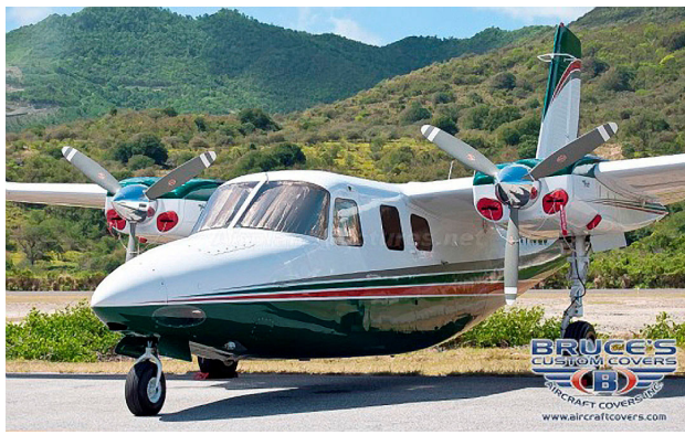
Aero Commander 500 Engine Inlet Plugs