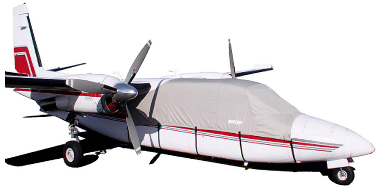
Aero Commander 690b Canopy Cover