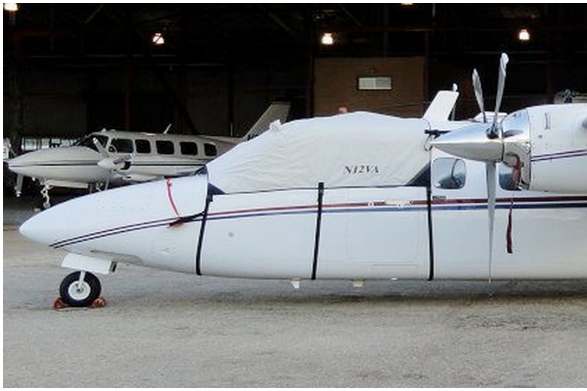
Rockwell Aero Commander 685, 690 & 840 Cockpit Cover