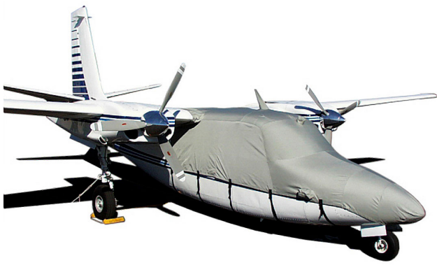
Aero Commander 500S Canopy/Nose Cover