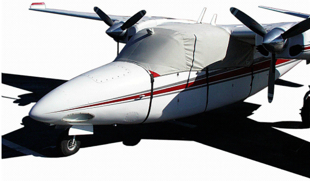
Aero Commander 680 Canopy Cover