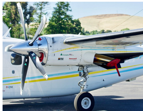
Aero Commander 690B Engine Inlet & Exhaust Plugs