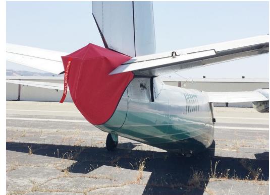
Rockwell Aero Commander Tailcone Cover