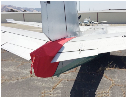
Rockwell Aero Commander Tailcone Cover