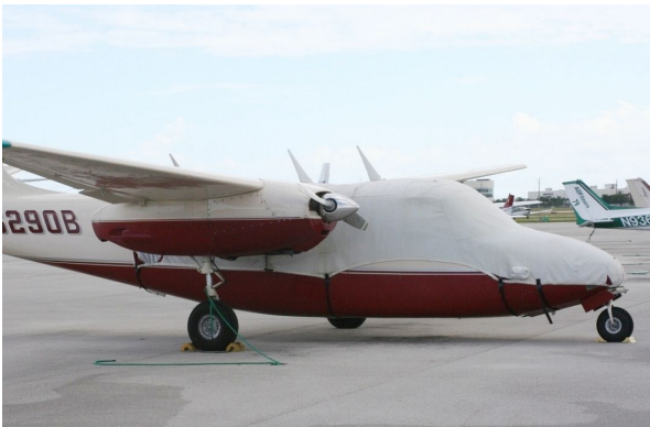
Aero Commander 500 Canopy/Nose Cover Over The Type