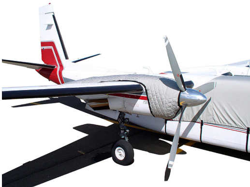
Aero Commander Insulated Engine Cover

This cover type is made from Silver Acrylic Sunbrella canvas and is 100% lined with a soft and smooth microfiber. Bruce's Custom Covers developed this material combination especially for aircraft protection. The outer material is medium weight and treated for water resistance, UV resistance and anti-static buildup. The inner lining is a very soft and smooth microfiber to prevent scratching. The material is very reflective, and tests show that the cabin interior temperature can be reduced to near-ambient temperature on the hottest of days. It is water, ice and snow repellent, yet breathable to allow moisture to escape from between the cover and the aircraft surface.