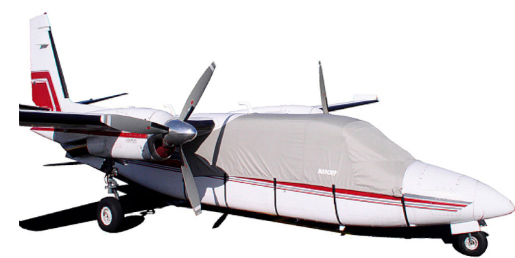
Aero Commander 690b Canopy Cover

This cover type is made from Silver Acrylic Sunbrella canvas and is 100% lined with a soft and smooth microfiber. Bruce's Custom Covers developed this material combination especially for aircraft protection. The outer material is medium weight and treated for water resistance, UV resistance and anti-static buildup. The inner lining is a very soft and smooth microfiber to prevent scratching. The material is very reflective, and tests show that the cabin interior temperature can be reduced to near-ambient temperature on the hottest of days. It is water, ice and snow repellent, yet breathable to allow moisture to escape from between the cover and the aircraft surface.