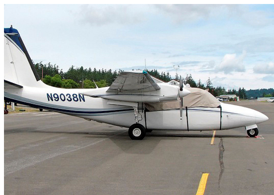
Aero Commander 500 Canopy Cover