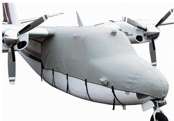
Canopy/Nose Cover (extends over top past leading edge)