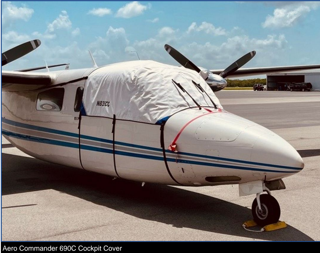
Aero Commander 690C Cockpit Cover