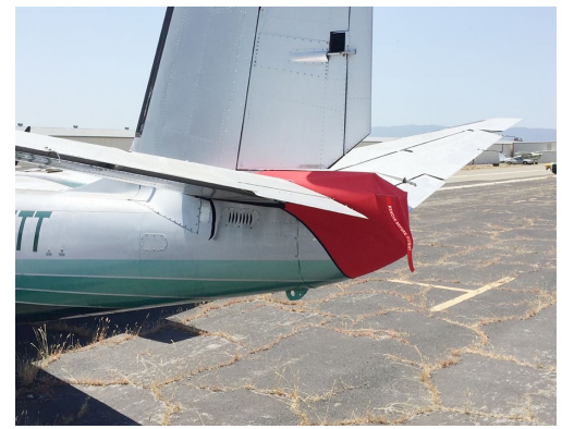
Rockwell Aero Commander Tailcone Cover