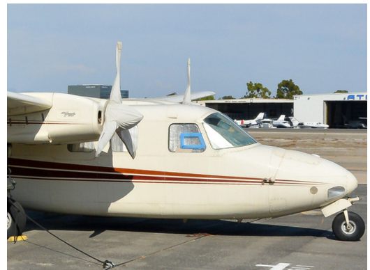
Aero Commander AC500 Ptopellor/Spinner Covers