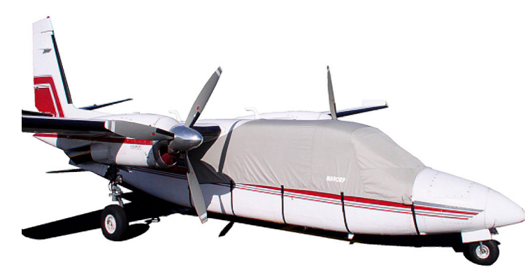
Aero Commander 690b Canopy Cover

Travel Covers are made with Silver Solution-Dyed Polyester fabric and only lined over the windshield to save weight. The material is lightweight and more compact for easy stowage in the aircraft. The polyester material is water resistant, but only intended for occasional use outside. We also have an ultra lightweight material available for fitted hangar dust covers. For daily outdoor use, the non-travel Sunbrella Cover is the best choice.