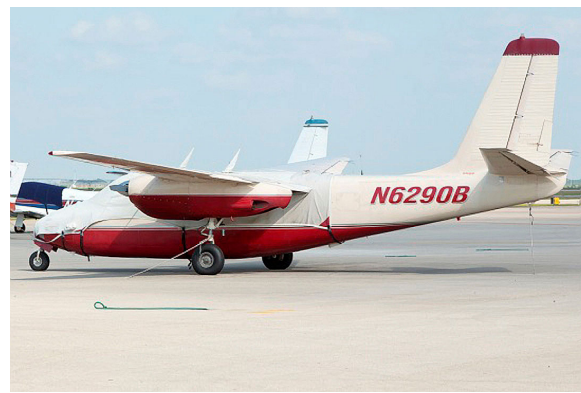
Aero Commander 500 Canopy/Nose Cover, Over-Top Type