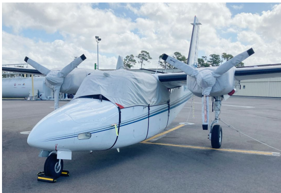
Aero Commander 500S Shrike Canopy, Engine & Prop Covers

This cover type is made from Silver Acrylic Sunbrella canvas and is 100% lined with a soft and smooth microfiber. Bruce's Custom Covers developed this material combination especially for aircraft protection. The outer material is medium weight and treated for water resistance, UV resistance and anti-static buildup. The inner lining is a very soft and smooth microfiber to prevent scratching. The material is very reflective, and tests show that the cabin interior temperature can be reduced to near-ambient temperature on the hottest of days. It is water, ice and snow repellent, yet breathable to allow moisture to escape from between the cover and the aircraft surface.