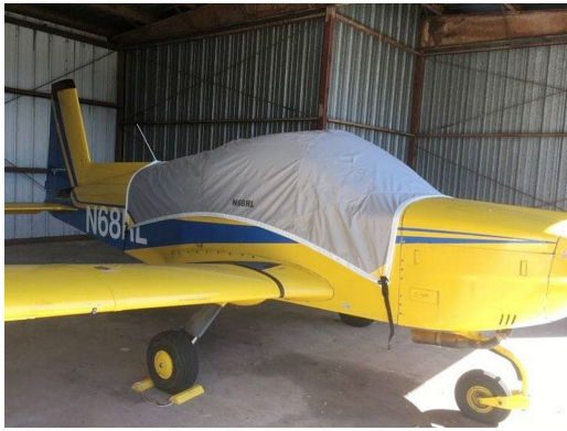
Grumman AA-5A Travel Canopy Cover