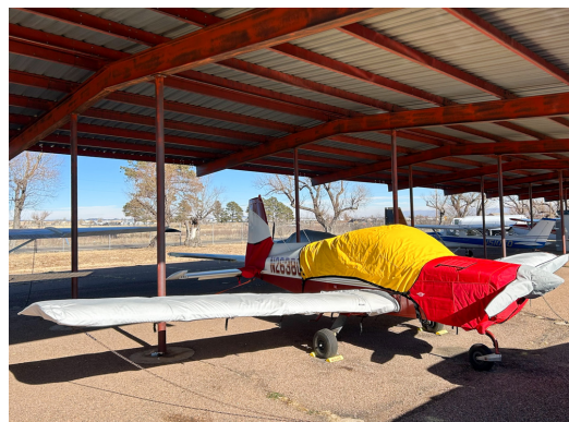
Grumman AA5: Tiger, Cheetah, Traveler Insulated Engine Cover