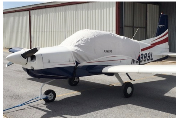
Grumman AA5: Tiger, Cheetah, Traveler Canopy Cover, Belly Strap Type