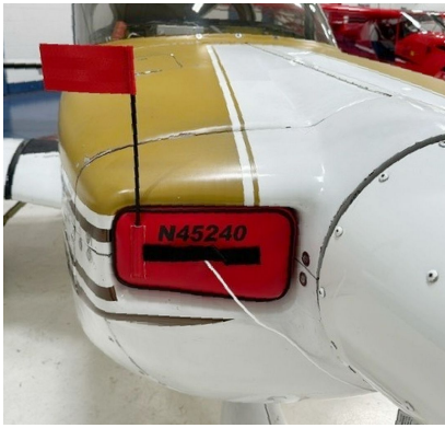
Grumman AA5 Engine Plugs