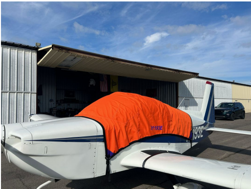
Grumman AA5 Canopy Cover