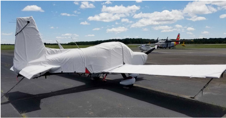
Grumman AA5 Complete Cover Set

WINTER USE MATERIAL - Made with Solution-Dyed Polyester fabric, this option is intended for seasonal use to aid in deicing, rain mitigation, or for occasional travel. The material is lighter and more compact, but more susceptible to UV damage and may have a shorter useful life if used continuously outside than the all-year use material.