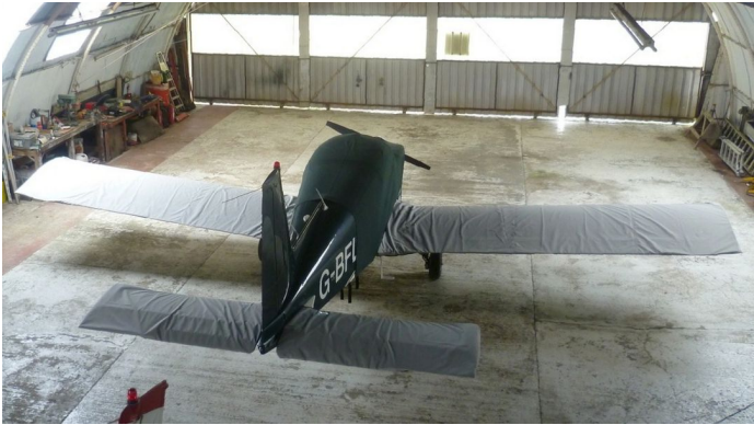
Grumman AA5 Wing & Horizontal Stabilizer Covers