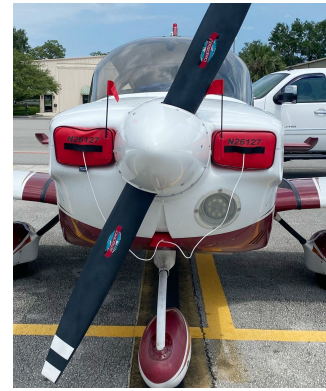
Grumman AA-5A Engine Plugs