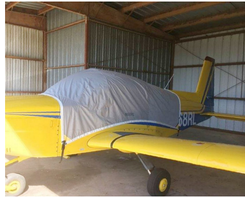
Grumman AA-5A Travel Canopy Cover