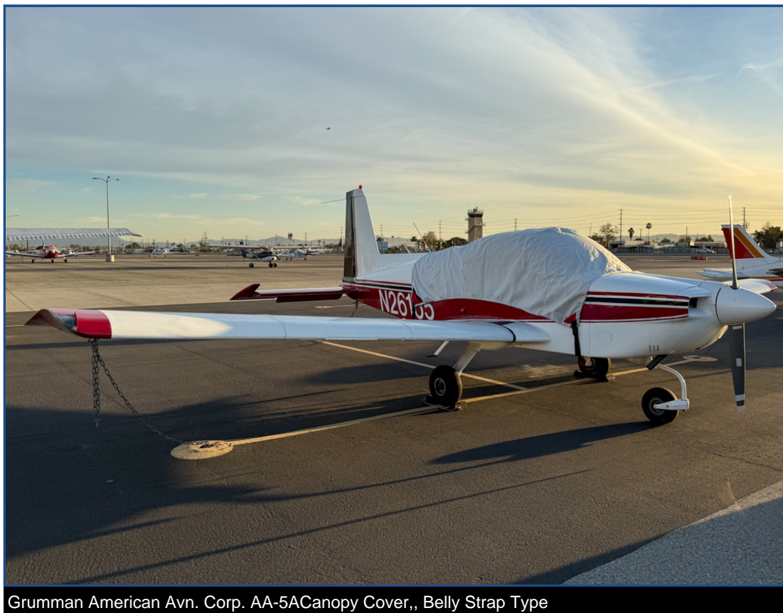
Grumman American Avn. Corp. AA-5A Canopy Cover,, Belly Strap Type