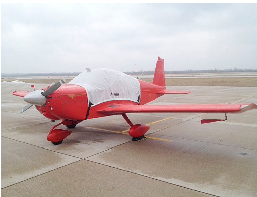
AA1 Canopy Cover, Engine Plugs

This cover type is made from Silver Acrylic Sunbrella canvas and is 100% lined with a soft and smooth microfiber. Bruce's Custom Covers developed this material combination especially for aircraft protection. The outer material is medium weight and treated for water resistance, UV resistance and anti-static buildup. The inner lining is a very soft and smooth microfiber to prevent scratching. The material is very reflective, and tests show that the cabin interior temperature can be reduced to near-ambient temperature on the hottest of days. It is water, ice and snow repellent, yet breathable to allow moisture to escape from between the cover and the aircraft surface.