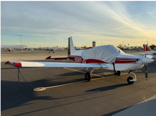
Grumman American Avn. Corp. AA-5ACanopy Cover,, Belly Strap Type

This cover type is made from Silver Acrylic Sunbrella canvas and is 100% lined with a soft and smooth microfiber. Bruce's Custom Covers developed this material combination especially for aircraft protection. The outer material is medium weight and treated for water resistance, UV resistance and anti-static buildup. The inner lining is a very soft and smooth microfiber to prevent scratching. The material is very reflective, and tests show that the cabin interior temperature can be reduced to near-ambient temperature on the hottest of days. It is water, ice and snow repellent, yet breathable to allow moisture to escape from between the cover and the aircraft surface.