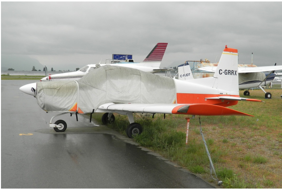
Grumman AA5 Extended Canopy Cover & Engine Cover