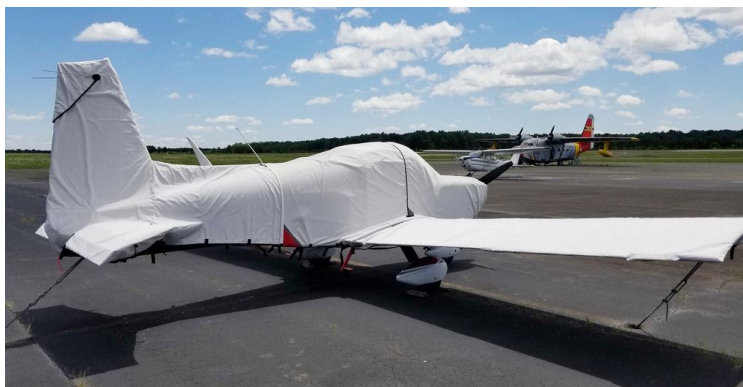
Grumman AA5 Complete Cover Set

WINTER USE MATERIAL - Made with Solution-Dyed Polyester fabric, this option is intended for seasonal use to aid in deicing, rain mitigation, or for occasional travel. The material is lighter and more compact, but more susceptible to UV damage and may have a shorter useful life if used continuously outside than the all-year use material.