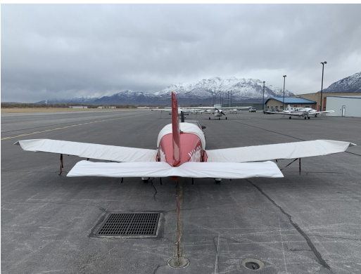
Grumman AA-1 Wing & Horizontal Stabilizer Covers