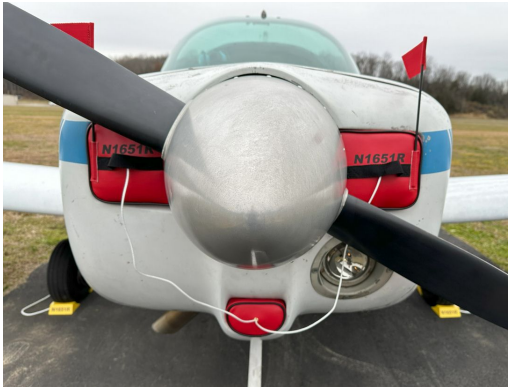
Grumman AA1 Engine Inlet Plugs

and dried if necessary. Engine plugs have warning flags that are visible from the cockpit or 'remove before flight' streamers sewn onto the face of the plugs. Most plugs are imprinted with the aircraft registration number in black for an extra charge. Storage bag NOT included. Engine plugs may be inserted after flight when the engine is still warm. Engine Inlet Plugs are commonly referred to as Cowl Plugs, Intake Plugs, Cowl Blocks, Engine Blocks, and Engine Bungs.