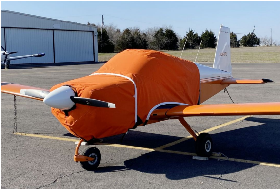
AA-1 Extended Canopy & Fully Enclosed Engine Cover

This cover type is made from Silver Acrylic Sunbrella canvas and is 100% lined with a soft and smooth microfiber. Bruce's Custom Covers developed this material combination especially for aircraft protection. The outer material is medium weight and treated for water resistance, UV resistance and anti-static buildup. The inner lining is a very soft and smooth microfiber to prevent scratching. The material is very reflective, and tests show that the cabin interior temperature can be reduced to near-ambient temperature on the hottest of days. It is water, ice and snow repellent, yet breathable to allow moisture to escape from between the cover and the aircraft surface.