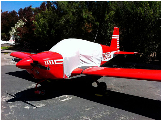
Grumman AA1 Extended Canopy Cover