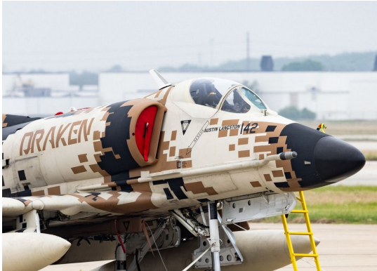
McDonnell Douglas A4 Skyhawk Engine Intake Plugs