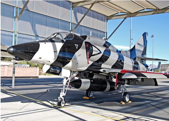
A4 Skyhawk Engine Inlet Plugs

The Engine Inlet Plugs are custom fit for your McDonnell Douglas A-4 Skyhawk, single & tandem intakes, made with heavy-duty vinyl material, and stuffed with a single block of sculpted urethane foam. Each plug has a zipper that allows the foam to be removed and dried if necessary. Engine plugs have 'remove before flight' streamers sewn onto the face of the plugs. Most plugs are imprinted with the aircraft registration number in black for an extra charge. Storage bag NOT included. Engine plugs may be inserted after flight when the engine is still warm. Engine Inlet Plugs are commonly referred to as Cowl Plugs, Intake Plugs, Cowl Blocks, Engine Blocks, and Engine Bungs.