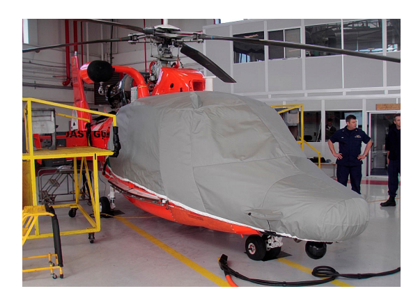
U.S. Coast Guard HH-65 Dolphin Bubble, Engine & Rotor MH-65C Bubble Cover, extended Nose/Radome Model, padded over windows, P/N: A365-210