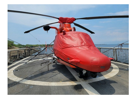
Aerospatiale AS365N2 Bubble, w/Extended Nose/Radome

Insulated Covers Material - A special composite material of solution-dyed polyester, 3M Thinsulate insulation, and soft nylon interior fabric. Our insulated covers are designed to complement an engine preheater and help retain heat in the engine compartment after shutdown. If you operate your aircraft in cold-weather, these covers will help prevent engine wear and tear.