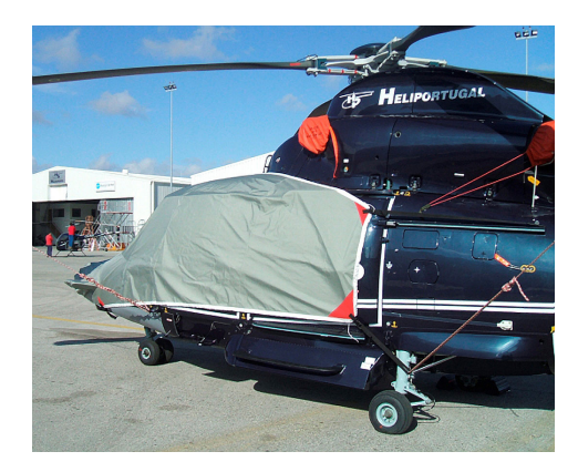
Dauphin Bubble Cover, extended nose

This cover type is made from Silver Acrylic Sunbrella canvas and is 100% lined with a soft and smooth microfiber. Bruce's Custom Covers developed this material combination especially for aircraft protection. The outer material is medium weight and treated for water resistance, UV resistance and anti-static buildup. The inner lining is a very soft and smooth microfiber to prevent scratching. The material is very reflective, and tests show that the cabin interior temperature can be reduced to near-ambient temperature on the hottest of days. It is water, ice and snow repellent, yet breathable to allow moisture to escape from between the cover and the aircraft surface.