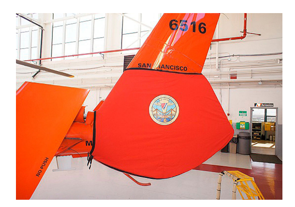
MH-365C Dauphin Tail Fan Fenestron Cover

The Tailboom Cover details vary by model, but generally the helicopter tail boom cover encloses the tail boom from the "bottleneck" to the aft end. They usually also cover the horizontal stabilizers, and are custom made to allow for antennae, lights, and other protrusions. They attach with straps underneath the tail boom. Covers for the vertical and horizontal stabilizers are also available separately. Specific information for each model is available on request.