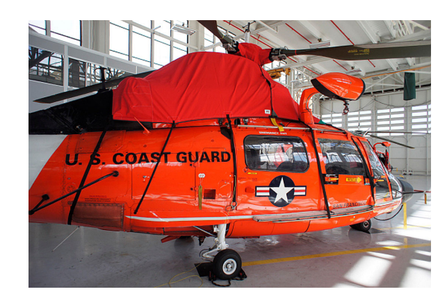
MH-65C Engine Area, Rotor Hub, Swash Plate Aperature Cover set, P/N: A365-210