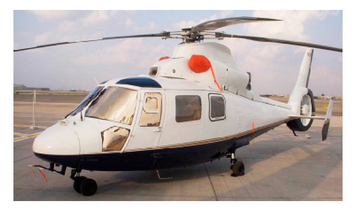
Dauphin HeatShield Set

Heatshields are interior sunshades for an aircraft's windows or canopy glass. The product is a unique composite of closed-cell foam with a silver mylar finish. The semi-rigid design is stiff enough to stand along the inside of the windshield using sun visors or window framing. It folds up flat and easily stores in the included storage sleeve. Some designs may require velcro and suction cups. A Heatshield is an excellent short-term remedy for cockpit overheating.