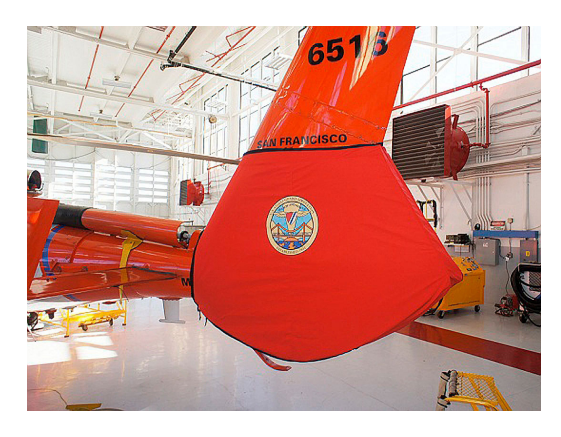
MH-365C Dauphin Tail Fan Fenestron Cover