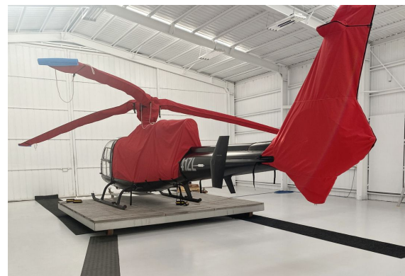
Aerospatiale Gazelle Engine, Rotor Hub, Blades & Tailfan Covers