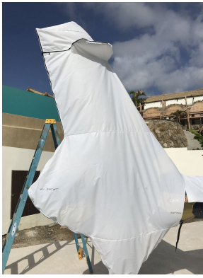
Aerospatiale Gazelle AS341 Tailfan Housing Extended Cover (test fit cover)