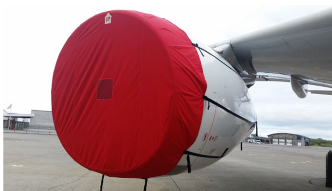
Airbus A330 Intake Cover, Trent 700 Engine