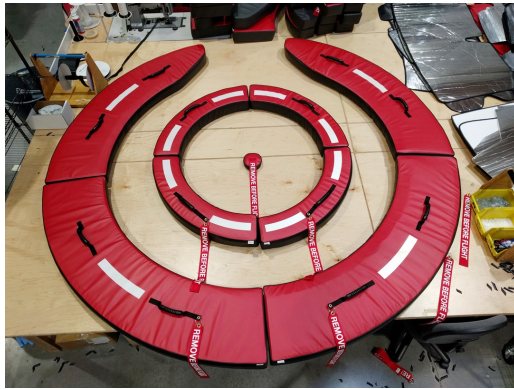
Boeing 747-8 Exhaust Plugs

The Engine Exhaust Plugs are custom fit for your Airbus A330, A350 exhaust openings, made with heavy-duty vinyl material, and stuffed with a single block of sculpted urethane foam. Each plug has a zipper that allows the foam to be removed and dried if necessary. Exhaust plugs have 'remove before flight' streamers sewn onto the face of the plugs. Most plugs are imprinted with the aircraft registration number in black for an extra charge. Exhaust plugs may be inserted soon after flight when the engine is still warm. Engine Inlet Plugs are commonly referred to as Cowl Plugs, Intake Plugs, Cowl Blocks, Engine Blocks, and Engine Bungs.