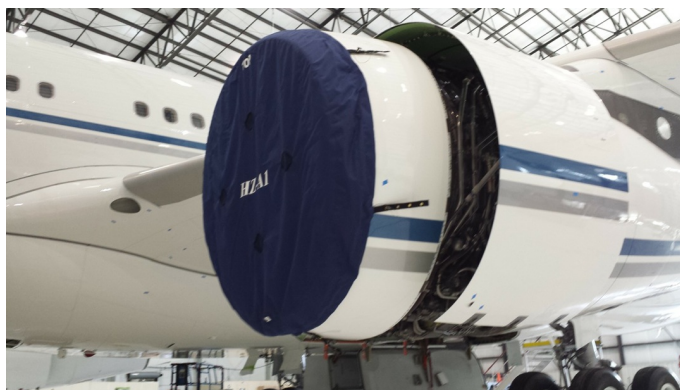
Airbus 340 Intake Covers