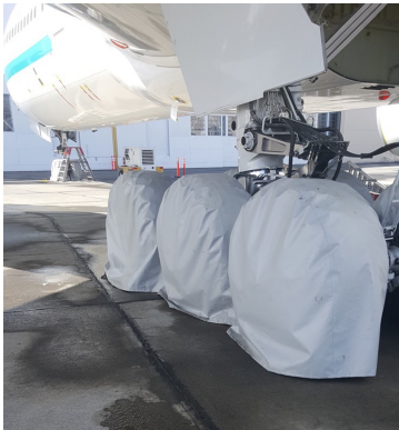
Boeing 777 Main & Nose Gear Tire Covers

ALL-YEAR USE MATERIAL - Made with Silver Acrylic Sunbrella canvas, the all-year use material is the best option for sun protection and cover longevity. This heavier more durable material is intended for all weather conditions, such as rain and snow or lots of sun.