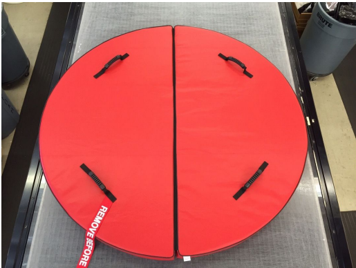
Boeing 737 Max Intake Plug, folding type