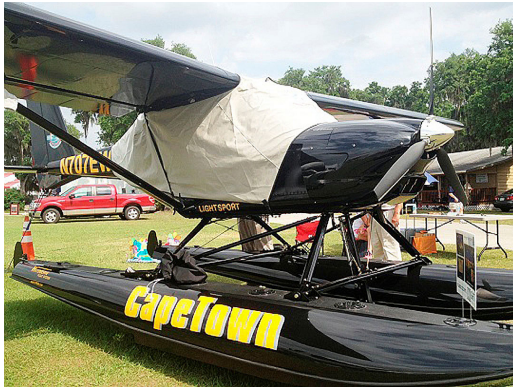
A-22 Over-the-Top Canopy Cover

occasional use outside. We also have an ultra lightweight material available for fitted hangar dust covers. For daily outdoor use, the non-travel Sunbrella Cover is the best choice.