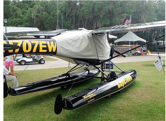
A-22 Over-the-Top Canopy Cover