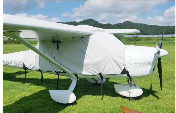
Aeroprakt A-32 Vixen Canopy Cover, Over-Top Type