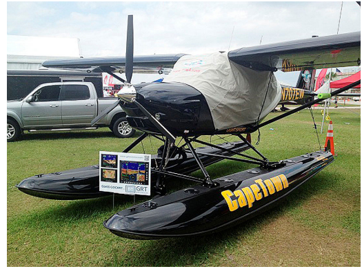
A-22 Over-the-Top Canopy Cover