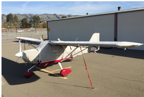
Eurofox Canopy, Engine, Wings and Empennage Covers

shorter useful life if used continuously outside than the all-year use material.