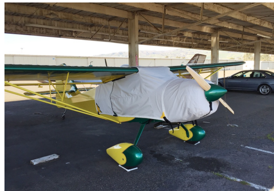
Kitfox Canopy & Engine Covers