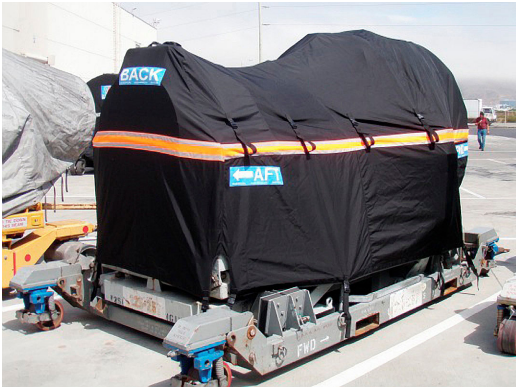
IAE V2500 QEC OFF-LINK JET ENGINE COVER, "rain cap" style

FABRIC & THREAD: For strength, durability and ease of use we make these covers of the heaviest nylon ballistic cloth. It is sewn in multiple courses with Tenara thread, and reinforced with heavy vinyl cloth at high-wear points.