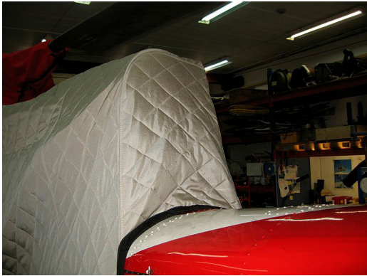
Alouette III Insulated Engine/Transmission Cover