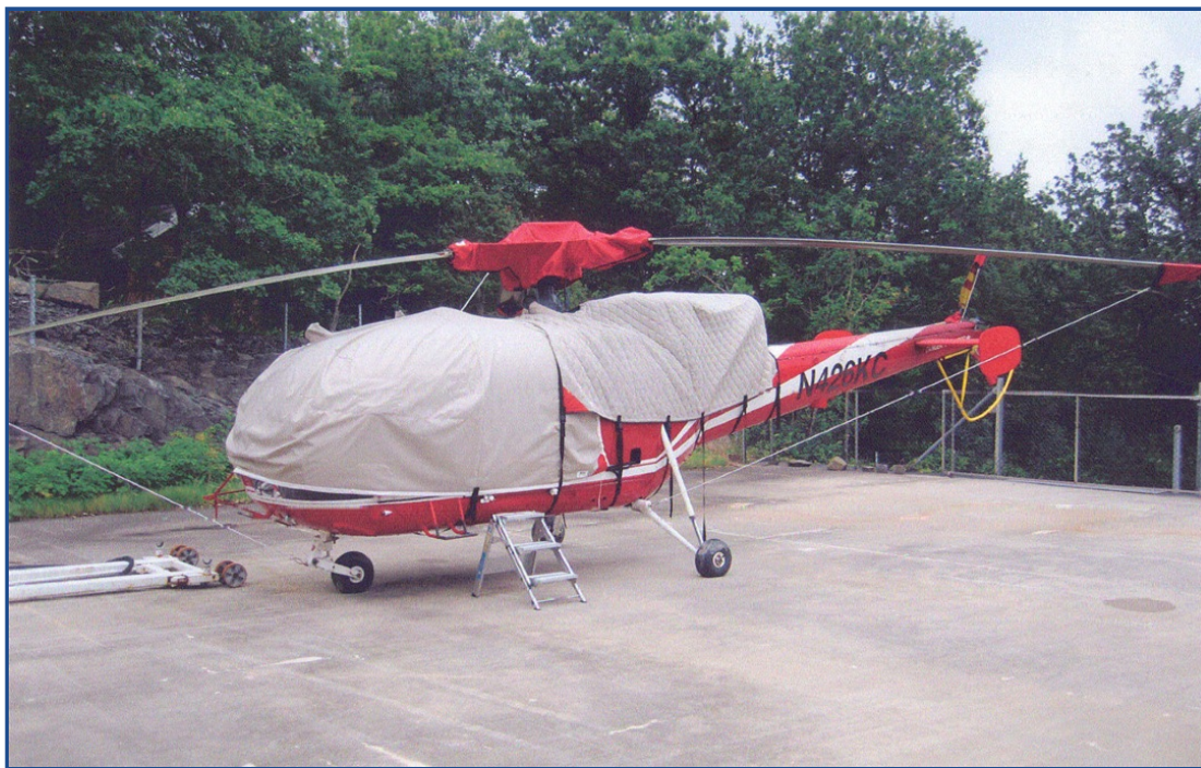
Alouette III Bubble, Rotor Hub &amp; Engine Covers, Blade Tie-Downs