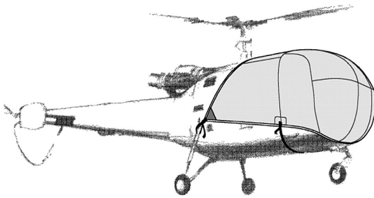
Bubble Cover for the Alouette III