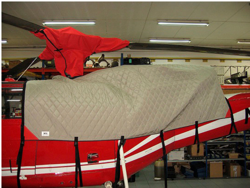
Alouette III Rotor Hub Cover & Engine/Transmission Cover Alouette III Rotor Hub Cover, Insulated Engine/Transmission Cover