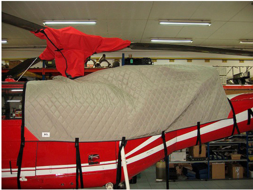
Alouette III Rotor Hub Cover, Insulated Engine/Transmission Cover