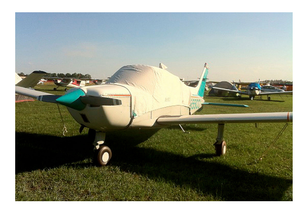
Beech C23 Sundowner Canopy Cover

Travel Covers are made with Silver Solution-Dyed Polyester fabric and only lined over the windshield to save weight. The material is lightweight and more compact for easy stowage in the aircraft. The polyester material is water resistant, but only intended for occasional use outside. We also have an ultra lightweight material available for fitted hangar dust covers. For daily outdoor use, the non-travel Sunbrella Cover is the best choice.