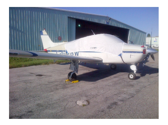
Beech Sierra Canopy Cover, Engine Plugs, Tailcone Cover