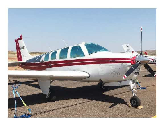
Beech A-36 Bonanza Cabin HeatShields