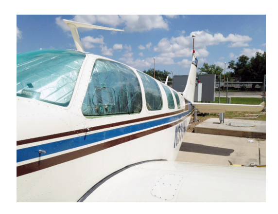
Beech Bonanza HeatShields

Windshield Heatshields are interior sunshades for an aircraft's front windshield. The product is a unique composite of closed-cell foam with a silver mylar finish. The semi-rigid design is stiff enough to stand along the inside of the windshield using sun visors or window framing. It folds up flat and easily stores in the included storage sleeve. Some designs may require velcro and suction cups or split right and left sides. A Heatshield is an excellent short-term remedy for cockpit overheating. An external fabric cover is far more effective and practical for long-term protection.