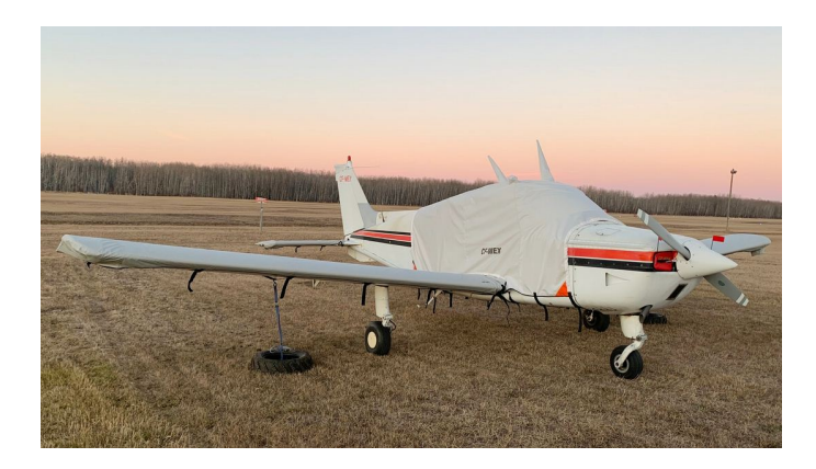
Beech Sierra Engine, Extended Canopy, Empennage, & Wing Covers