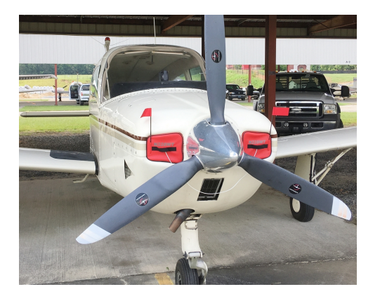
Beech Sierra Engine Inlet Plugs