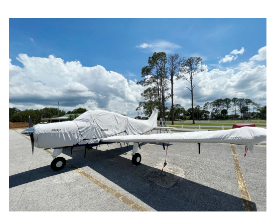
Beech Musketeer A23 Cover Set