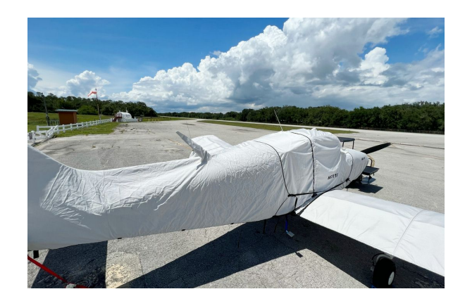
Beech Musketeer A23 Cover Set

This cover type is made from Silver Acrylic Sunbrella canvas and is 100% lined with a soft and smooth microfiber. Bruce's Custom Covers developed this material combination especially for aircraft protection. The outer material is medium weight and treated for water resistance, UV resistance and anti-static buildup. The inner lining is a very soft and smooth microfiber to prevent scratching. The material is very reflective, and tests show that the cabin interior temperature can be reduced to near-ambient temperature on the hottest of days. It is water, ice and snow repellent, yet breathable to allow moisture to escape from between the cover and the aircraft surface.