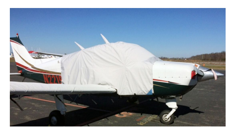
Beech Sundowner Extended Canopy Cover, Belly Strap Type