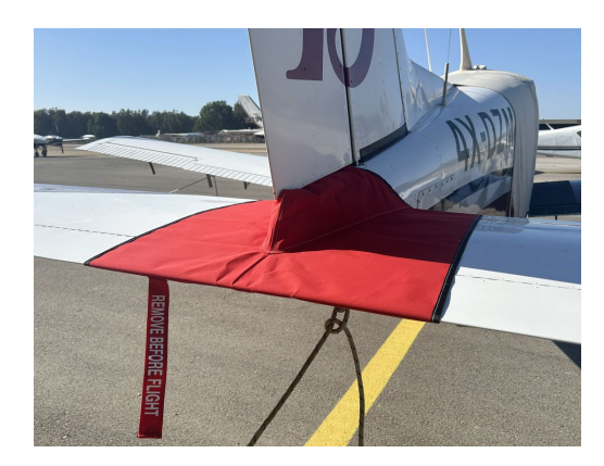
Beech Sierra A24 & C23R Tailcone Cover, Fully Enclosed

WINTER USE MATERIAL - Made with Solution-Dyed Polyester fabric, this option is intended for seasonal use to aid in deicing, rain mitigation, or for occasional travel. The material is lighter and more compact, but more susceptible to UV damage and may have a shorter useful life if used continuously outside than the all-year use material.