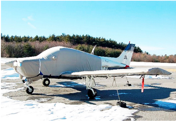
Prop, Engine, Extended Canopy, Wing, Tailcone, and Horizontal Stab Covers