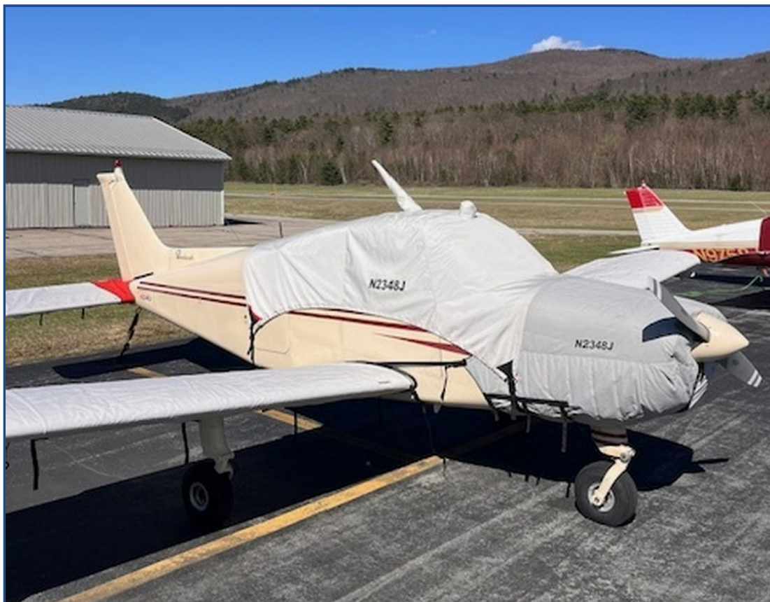
Beech A23 Musketeer Canopy, Insulated Engine, Wing Covers