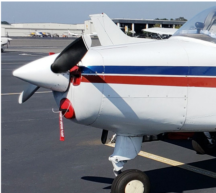
Beech Musketeer Engine Inlet Plugs

Engine Inlet Plugs are custom fit for your Beech Musketeer A23 intakes, made with heavy-duty vinyl material, and stuffed with a single block of sculpted urethane foam. Each plug has a zipper that allows the foam to be removed and dried if necessary. Engine plugs have warning flags that are visible from the cockpit or 'remove before flight' streamers sewn onto the face of the plugs. Most plugs are imprinted with the aircraft registration number in black for an extra charge. Storage bag NOT included. Engine plugs may be inserted after flight when the engine is still warm. Engine Inlet Plugs are commonly referred to as Cowl Plugs, Intake Plugs, Cowl Blocks, Engine Blocks, and Engine Bungs.