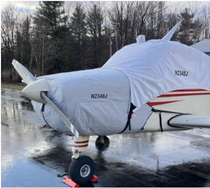
Beech Musketeer Insulated Engine Cover

This cover type is made from Silver Acrylic Sunbrella canvas and is 100% lined with a soft and smooth microfiber. Bruce's Custom Covers developed this material combination especially for aircraft protection. The outer material is medium weight and treated for water resistance, UV resistance and anti-static buildup. The inner lining is a very soft and smooth microfiber to prevent scratching. The material is very reflective, and tests show that the cabin interior temperature can be reduced to near-ambient temperature on the hottest of days. It is water, ice and snow repellent, yet breathable to allow moisture to escape from between the cover and the aircraft surface.