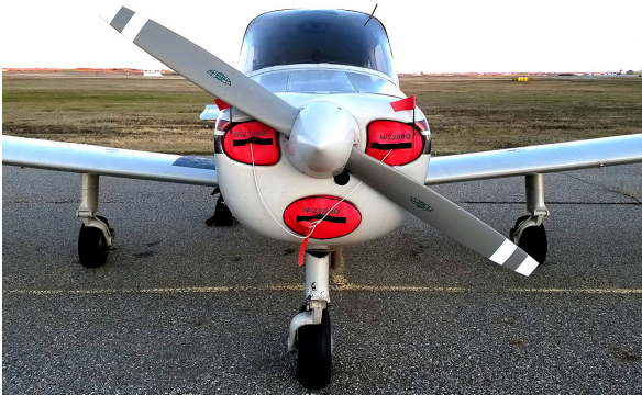
Beech Musketeer Engine Inlet Plugs