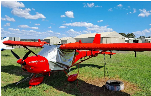
Aeroprakt A22 Wing & Empennage Covers

WINTER USE MATERIAL - Made with Solution-Dyed Polyester fabric, this option is intended for seasonal use to aid in deicing, rain mitigation, or for occasional travel. The material is lighter and more compact, but more susceptible to UV damage and may have a shorter useful life if used continuously outside than the all-year use material.