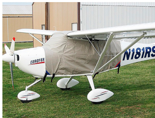
Eurofox LSA Extended Canopy Cover (same as an Aerotrek)