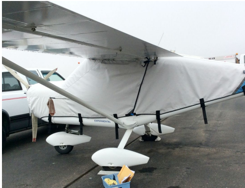
Aeroprakt A-22 Valor Canopy/Engine Cover

This cover type is made from Silver Acrylic Sunbrella canvas and is 100% lined with a soft and smooth microfiber. Bruce's Custom Covers developed this material combination especially for aircraft protection. The outer material is medium weight and treated for water resistance, UV resistance and anti-static buildup. The inner lining is a very soft and smooth microfiber to prevent scratching. The material is very reflective, and tests show that the cabin interior temperature can be reduced to near-ambient temperature on the hottest of days. It is water, ice and snow repellent, yet breathable to allow moisture to escape from between the cover and the aircraft surface.