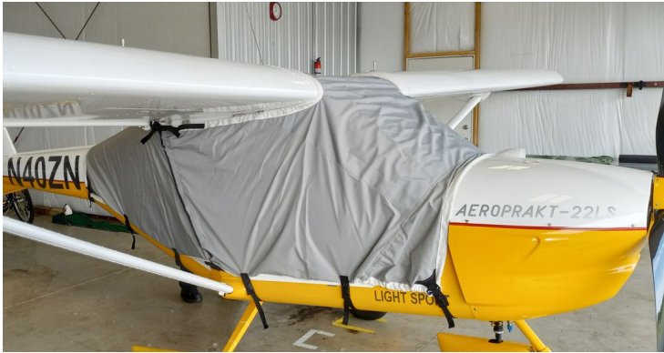
Aeroprakt A-22 Travel Weight Canopy Cover