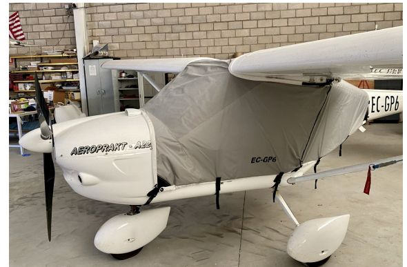
Aeroprakt A22 Over-Top Canopy Cover