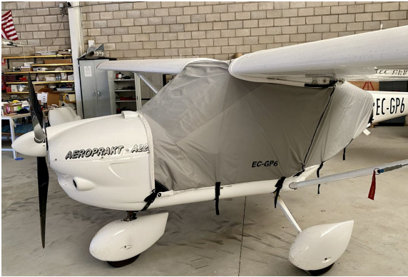
Aeroprakt A22 Over-Top Canopy Cover

Travel Covers are made with Silver Solution-Dyed Polyester fabric and only lined over the windshield to save weight. The material is lightweight and more compact for easy stowage in the aircraft. The polyester material is water resistant, but only intended for occasional use outside. We also have an ultra lightweight material available for fitted hangar dust covers. For daily outdoor use, the non-travel Sunbrella Cover is the best choice.