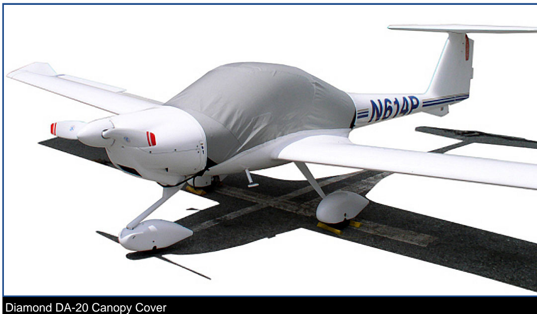
Diamond DA-20 Canopy Cover