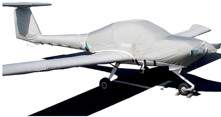
Diamond DA-20 Full Cover Set