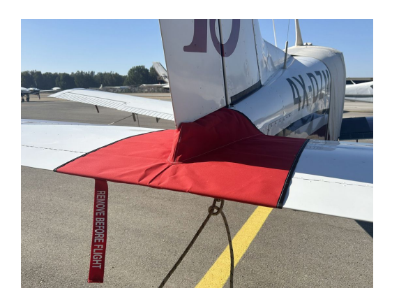
Beech Sierra A24 & C23R Tailcone Cover, Fully Enclosed

WINTER USE MATERIAL - Made with Solution-Dyed Polyester fabric, this option is intended for seasonal use to aid in deicing, rain mitigation, or for occasional travel. The material is lighter and more compact, but more susceptible to UV damage and may have a shorter useful life if used continuously outside than the all-year use material.