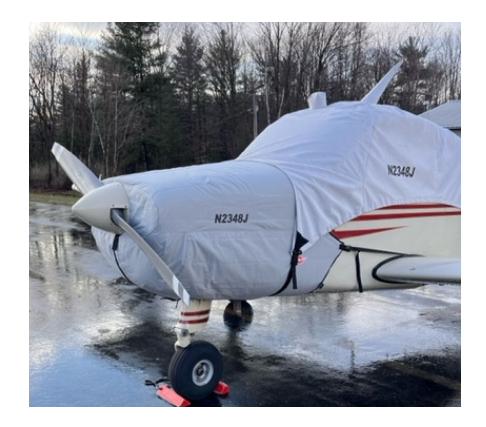
Beech Musketeer Insulated Engine Cover

This cover type is made from Silver Acrylic Sunbrella canvas and is 100% lined with a soft and smooth microfiber. Bruce's Custom Covers developed this material combination especially for aircraft protection. The outer material is medium weight and treated for water resistance, UV resistance and anti-static buildup. The inner lining is a very soft and smooth microfiber to prevent scratching. The material is very reflective, and tests show that the cabin interior temperature can be reduced to near-ambient temperature on the hottest of days. It is water, ice and snow repellent, yet breathable to allow moisture to escape from between the cover and the aircraft surface.