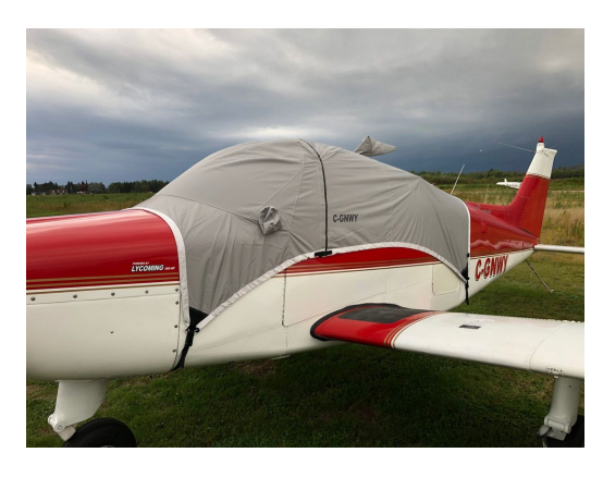
Beech Sundowner Travel Canopy Cover

Travel Covers are made with Silver Solution-Dyed Polyester fabric and only lined over the windshield to save weight. The material is lightweight and more compact for easy stowage in the aircraft. The polyester material is water resistant, but only intended for occasional use outside. We also have an ultra lightweight material available for fitted hangar dust covers. For daily outdoor use, the non-travel Sunbrella Cover is the best choice.