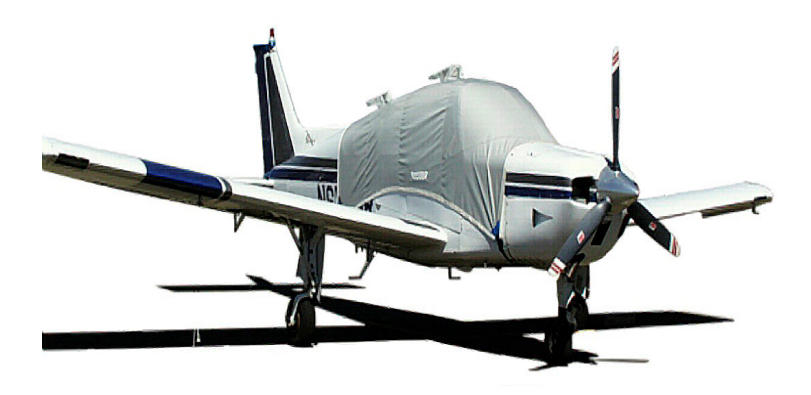
Beech Sport Canopy Cover