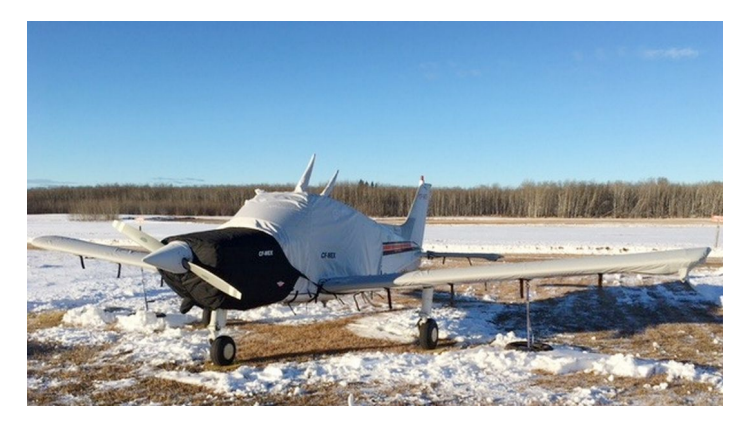
Beech Sport Insulated Engine Cover & Winter Cover Set