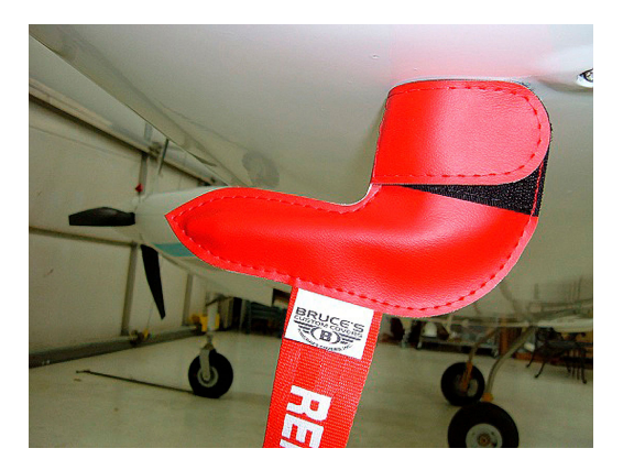
Sport B19 Engine Inlet Plugs