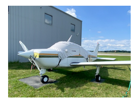
Beech Sport A19 Canopy Cover

This cover type is made from Silver Acrylic Sunbrella canvas and is 100% lined with a soft and smooth microfiber. Bruce's Custom Covers developed this material combination especially for aircraft protection. The outer material is medium weight and treated for water resistance, UV resistance and anti-static buildup. The inner lining is a very soft and smooth microfiber to prevent scratching. The material is very reflective, and tests show that the cabin interior temperature can be reduced to near-ambient temperature on the hottest of days. It is water, ice and snow repellent, yet breathable to allow moisture to escape from between the cover and the aircraft surface.