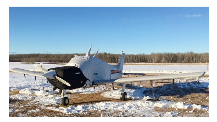
Beech Sport Insulated Engine Cover & Winter Cover Set