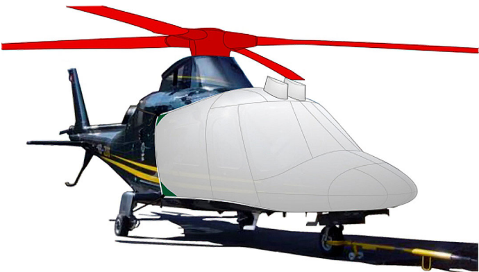
Agusta Leonardo A169 Bubble Cover with Wire Strike, 3D model Agusta 109 Bubble, Rotor Hub & Blade Covers (illustration)