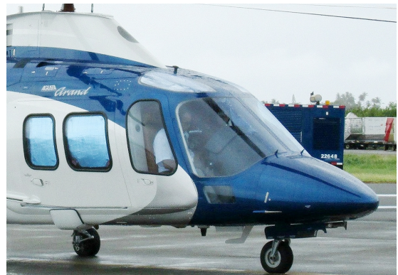
Agusta Grand Cabin & Skylight HeatShields