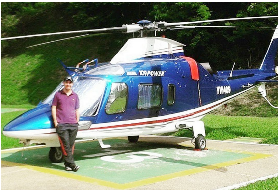
Agusta Power Cockpit & Cabin HeatShields

Cockpit Heatshields are interior sunshades for the aircraft's cockpit. The product is a unique composite of closed-cell foam with a silver mylar finish. The semi-rigid design is stiff enough to stand inside the window framing. Darts and folds are incorporated into the material so that it conforms to the complex shape of the helicopter windows. The set folds up flat and is easily stored in the included storage sleeve. Some designs may require velcro and suction cups. A Heatshield is an excellent short-term remedy for cockpit overheating, but an external fabric cover is more effective for long-term protection.