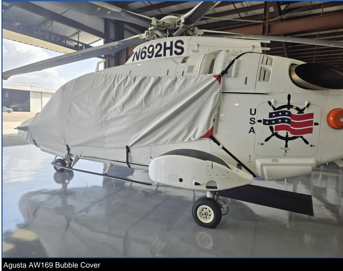
Agusta AW169 Bubble Cover