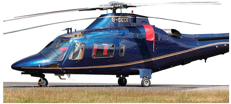
Agusta Power Intake Cover