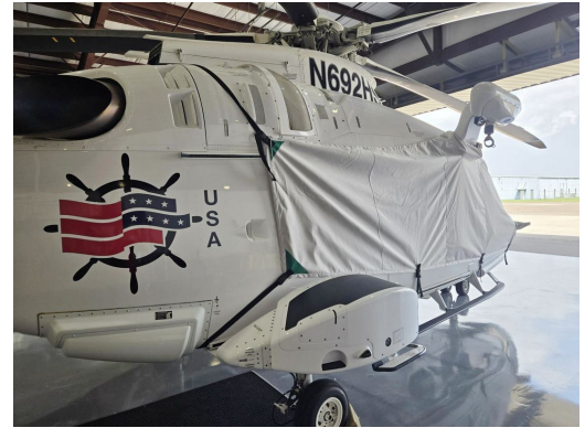
Agusta AW169 Bubble Cover