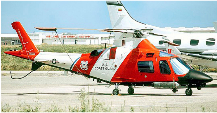
Covers, Plugs, HeatShields and related items for the Agusta MH-68A

Heatshields are interior sunshades for an aircraft's windows or canopy glass. The product is a unique composite of closed-cell foam with a silver mylar finish. The semi-rigid design is stiff enough to stand along the inside of the windshield using sun visors or window framing. It folds up flat and easily stores in the included storage sleeve. Some designs may require velcro and suction cups. A Heatshield is an excellent short-term remedy for cockpit overheating.