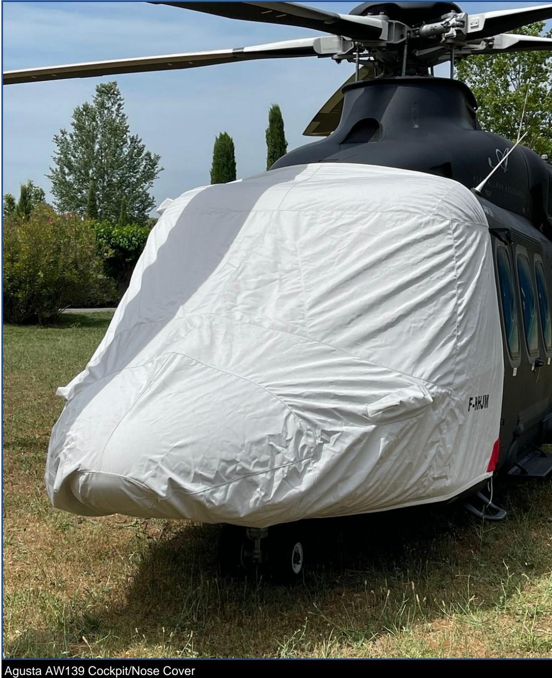
Agusta AW139 Cockpit/Nose Cover