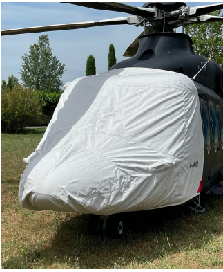
Agusta AW139 Cockpit/Nose Cover