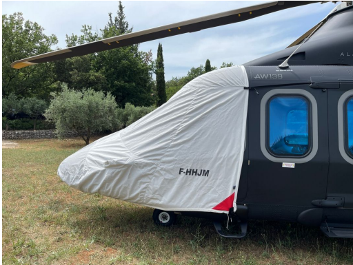
Agusta AW139 Cockpit/Nose Cover

This cover type is made from Silver Acrylic Sunbrella canvas and is 100% lined with a soft and smooth microfiber. Bruce's Custom Covers developed this material combination especially for aircraft protection. The outer material is medium weight and treated for water resistance, UV resistance and anti-static buildup. The inner lining is a very soft and smooth microfiber to prevent scratching. The material is very reflective, and tests show that the cabin interior temperature can be reduced to near-ambient temperature on the hottest of days. It is water, ice and snow repellent, yet breathable to allow moisture to escape from between the cover and the aircraft surface.